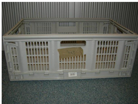
Plastic basket