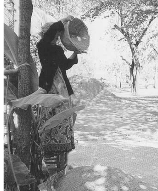
Fig D. Winnowing