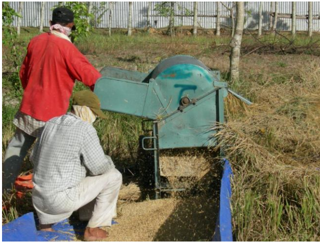
Fig C. Thresher (source Victor; ACF Aceh 2006).