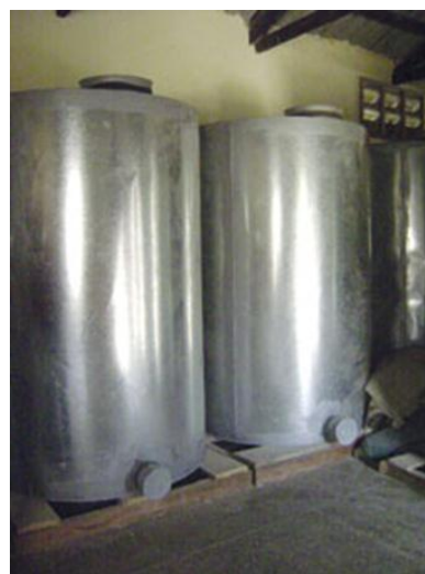
Metal silo

The household metal silo is one of the key post-harvest technologies in the fight against hunger and for food security. It is a simple structure that allows grains to be kept for long periods and prevents attack from pests such as rodents, insects and birds. If the grains have been properly dried (<14 % moisture in the case of cereals and <10 % in the case of pulses and oilseeds) and the household metal silo is kept under cover, there are no problems of moisture condensation inside it.