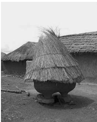
Mud silo

One approach to reducing PHL during storage is either by improving existing store types so that they perform better, or by introducing existing traditional store types ( mud silo ) more effective than those usually used by the communities or by introducing new storage type ( metal silo ).