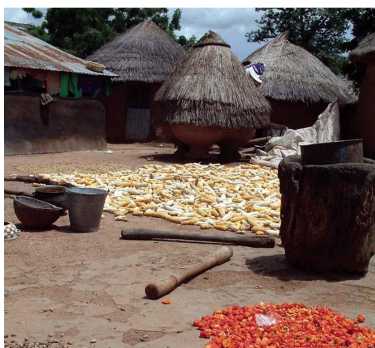
Fig A. Maize drying in the yard.