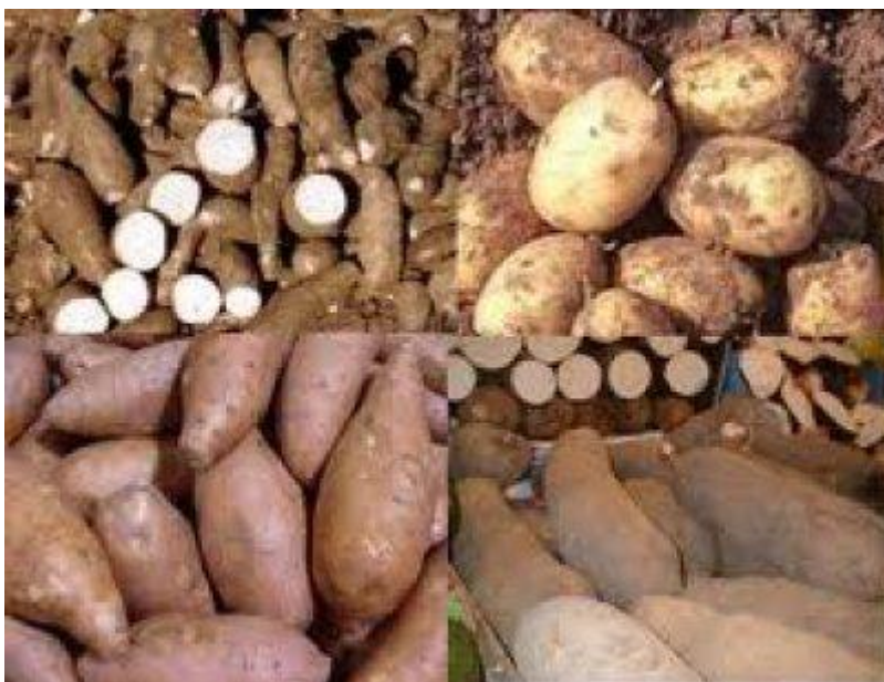
Root and tuber. http://www.ghananewsagency.org/details/Science/Post-harvest-losses-in-root-and-tuber-production-to-be-reversed/?ci=8&ai=45284