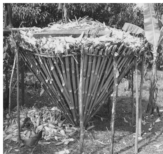
Fig B. Maize drying in a crib