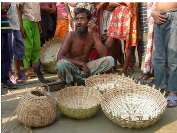
Fig F: Bamboo baskets ACF Bangladesh.