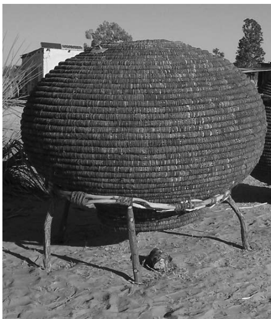
Traditional mopane 2 wood model