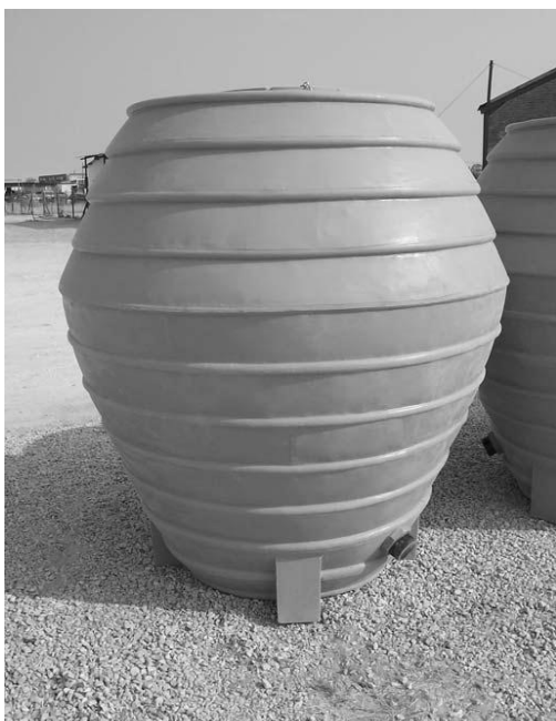
Plastic granary (Source: Rick Hodges) Hodges)