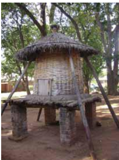
Traditional granary