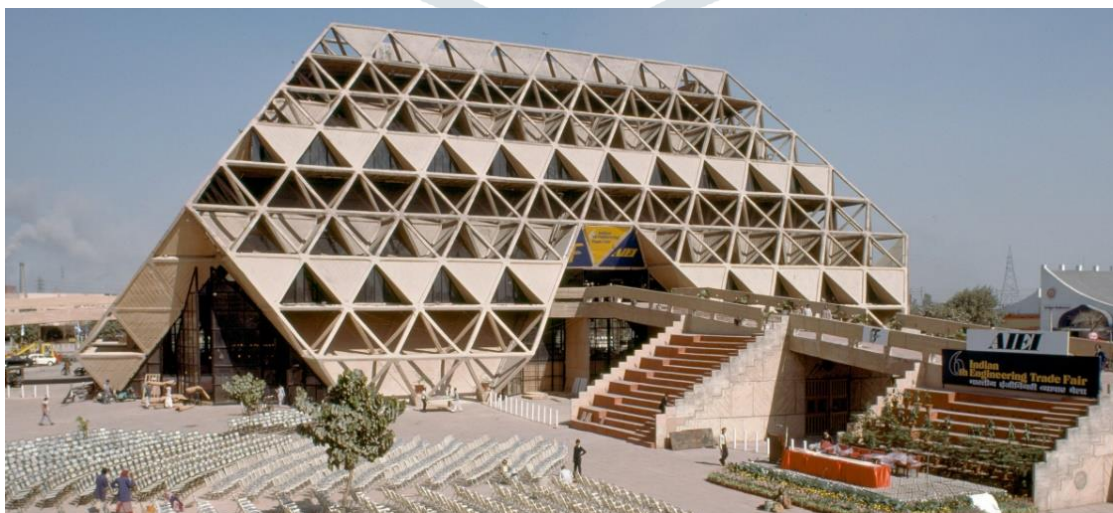
Figure 6: The Permanent Exhibition Complex, Pragati Maidan, New Delhi

The Permanent Exhibition Complex, Pragati Maidan, New Delhi, (1972) by Raj Rewal was characterized by monumental, truncated pyramid form with a space frame structure made of concrete elements. The depth of the structural system used as a sun-breaker and conceived as a traditional jail.