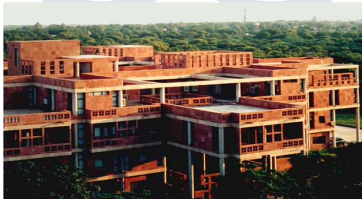
Figure 5: Central Institute of Educational Technology, New Delhi

The Central Institute of Educational Technology, New Delhi (1986) by Raj Rewal had a fluctuating circulation interspersed with small balconies and occasional chattris which modulate the light and shade and the viewing platforms was exuberant using sandstone which was the cheapest building material in this region.