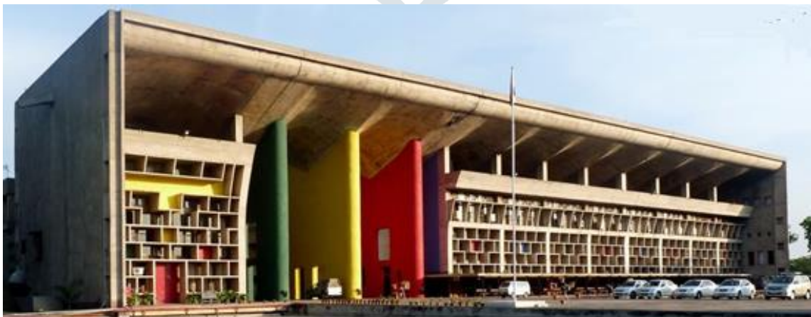
Figure 3: High Court, Chandigarh

Chandigarh became a powerful symbol of New India and inspired the architects and the public for a forward looking Modern Architecture in the Post-Independence period.