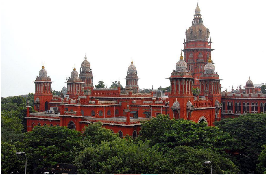
Figure 2: Madras High Court

Sir Edwin Lutyens, British architect designed The Parliament, Secretariat, and the whole capital of New Delhi. These buildings draw elements from native Indo-Islamic and Indian architecture and combined it with the Gothic revival and Neo-classical styles favoured in Victorian Britain. Lavish colonnades, rectangular windows, pediments for windows, classical portico, rustification on the plaster, were some characters.