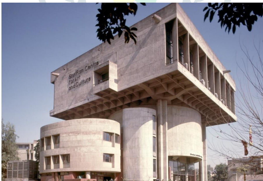
Figure 4: Sri Ram Cultural Centre, New Delhi

The plasticity of concrete was exploited in geometric forms of Sri Ram Cultural Center, New Delhi (1969) by Shiv Nath Prasad which promotes dance, drama and theatre. It expresses a bold statement of form extending the vocabulary of RCC.