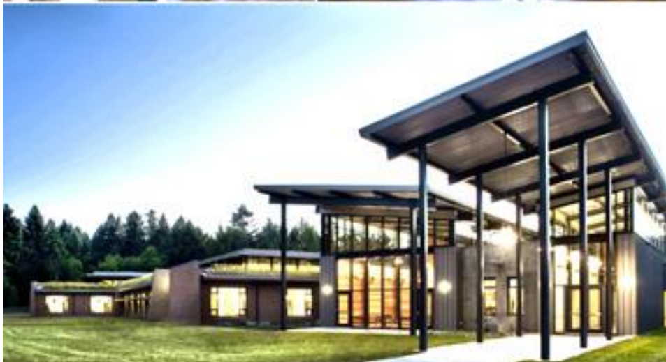
Community Living Center VA Puget Sound, American Lake