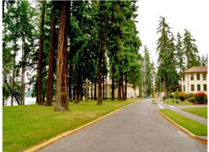
Medical Center Grounds

The VA Puget Sound Health Care System (VAPSHCS) is comprised of two divisions (American Lake and Seattle), each with its own Psychology Training Program. The American Lake Division of VAPSHCS is located in Lakewood, a major suburb of Tacoma, Washington. Nestled along 1.8 miles of the beautiful American Lake shoreline with Mt. Rainier standing to the East, this Division enjoys one of the most beautiful settings in the VA system. The 378 acres of medical center grounds include 110 acres of natural habitat, 8 acres of lawns, and a 55-acre golf course.