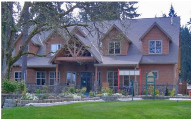
Club House, Veterans Golf Course

The medical center was dedicated in 1924 and chartered with a single mission — neuropsychiatric treatment. On March 15, 1924, the first 50 patients were admitted to the hospital, by transfer, from Western State Hospital at Fort Steilacoom. Over the years, American Lake has grown from its original mission to a national leader in integrated health care.