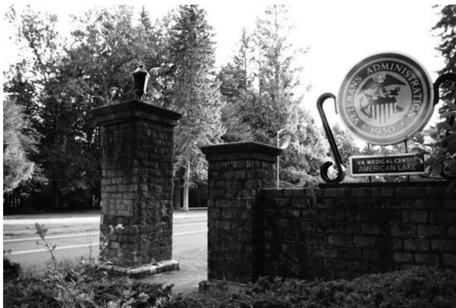
Entrance, American Lake Division