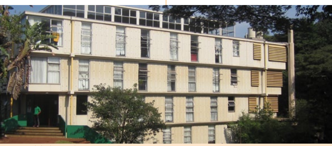
Mabel Palmer Residence, Howard College campus.

As a guideline, a total amount of R24 000 (South African Rand) should be allowed for