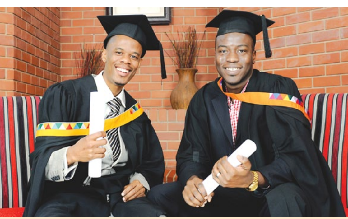
Graduates at the Graduate School of Business and Leadership.