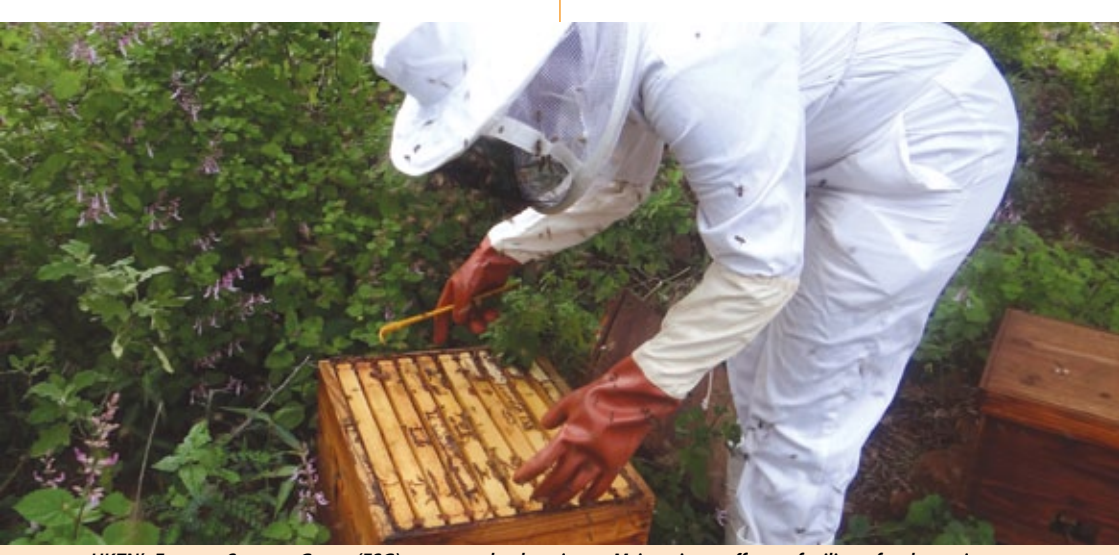
UKZN's Farmers Support Group (FSG) promotes beekeeping at Msinga in an effort to facilitate food security.

The UKZN Language Centre provides a testing service and English language courses for those who do not meet these requirements. After testing, students whose scores are comparable to the required IELTS or TOEFL scores can apply to enter a degree programme. Those who do not are advised to spend one or two semesters learning English in the Language Centre.