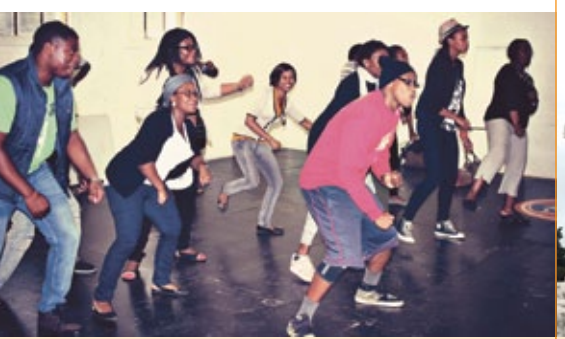
International students participating in a dance class at the BAT Centre.

Please note that the above fees cover tuition fees only. Provision must be made for all other necessary expenses such as accommodation, food, transport and subsistence (see pages 14-15). From the fees listed above, students should take into account only those costs which are relevant to their studies at the University.