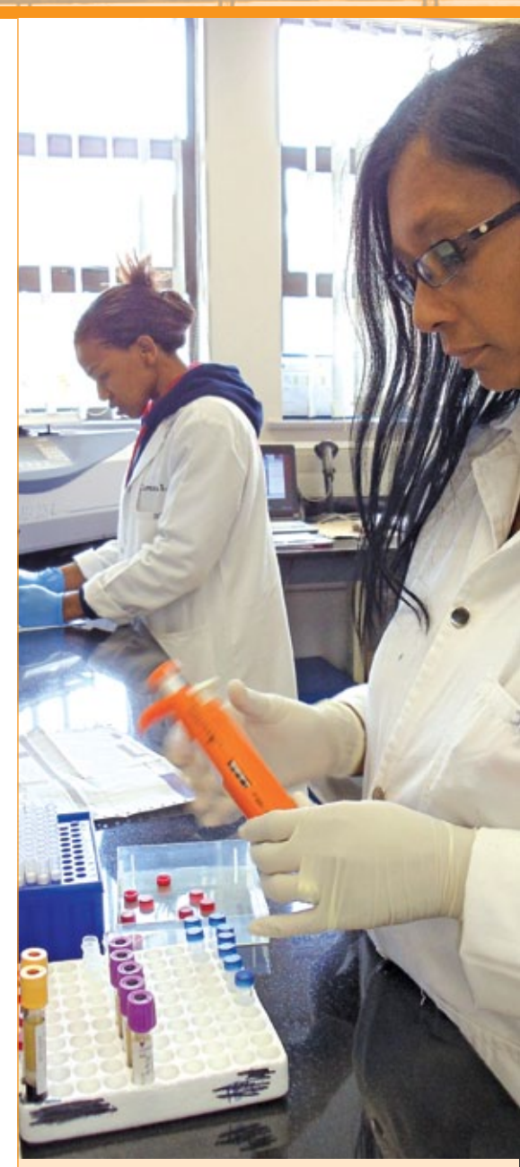
Preparing samples for testing.