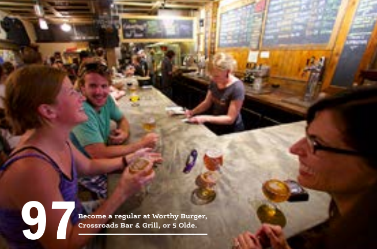
97 Become a regular at Worthy Burger, Crossroads Bar & Grill, or 5 Olde.