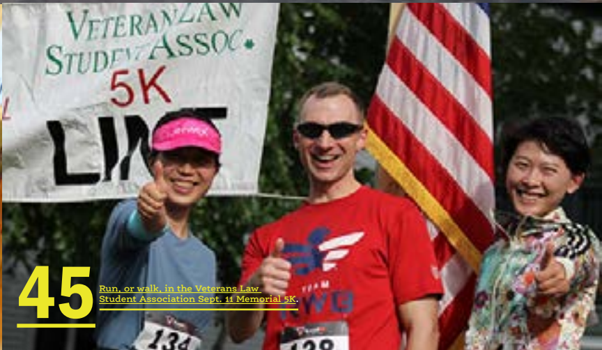
45 Run, or walk, in the Veterans Law Student Association Sept. 11 Memorial 5K.