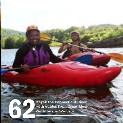
62 Kayak the Connecticut River with guides from Great River Outfitters in Windsor.