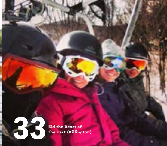
33 Ski the Beast of the East (Killington).