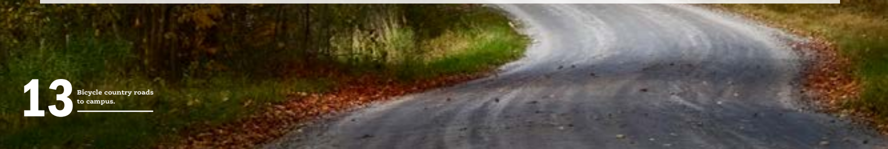
13 Bicycle country roads to campus.