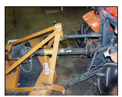
Figure 2. Driveline connected to the tractor

(IID). The entire IID shaft is a wrap point hazard if the IID is completely unshielded. If the IID shaft is partially guarded, the shielding is usually over the straight part of the shaft, leaving the universal joints, the PTO connection (front connector), and the Implement Input Connections (IIC, the rear connector) as the wrap point hazards. Protruding pins and bolts used as