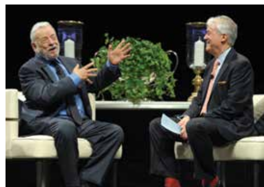
Stephen Sondheim pictured with NPR's Scott Simon