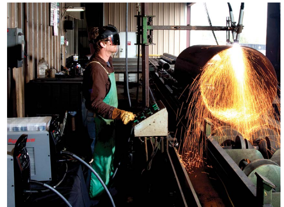
Pipe cutting and beveling