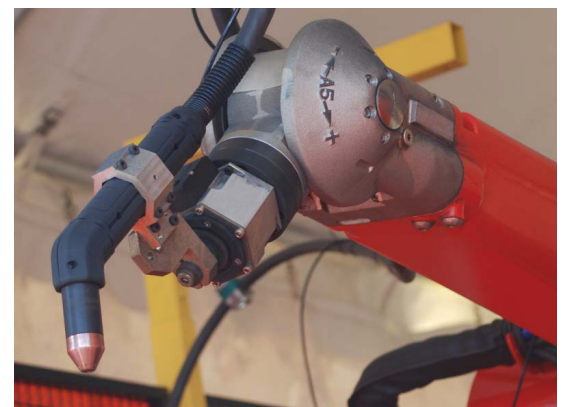
Robotic 3-dimensional cutting

*20:1, 21.1:1, 30:1, 40:1, and 50:1 ratios