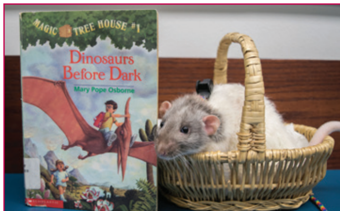
Vincent the rat enjoys reading with children!

"Training Willow was like training one of my dogs,"