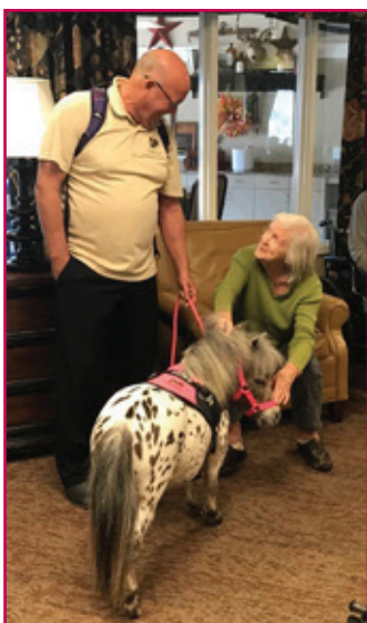
Mini horse Hope brightens a client's day