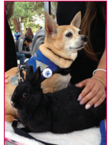
Button the rabbit and her dog pal Mokie during a visit

around too much, a rabbit or guinea pig that freezes is uncomfortable or frightened, and handlers need to be very attuned to when their pets are stressed. Clients need guidance in petting these animals, since their size can make them vulnerable if petted too roughly. They need to wear harness and leash during visits, which can present a challenge in training them to become therapy animals.