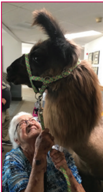
Marisco and his special touch

a Pet Partners therapy animal are the heart of our mission. Bringing more therapy animal visits to more people is our ultimate goal, and we'll continue to work with the best therapy animal teams there are, of all nine types.