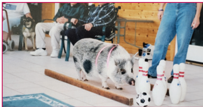
Willow the therapy pig enjoyed playing games with clients

The biggest drawback with therapy rats is the public perception. "People are still very wary of rats," says Chesnut. "We've been denied access to hospitals and some schools because of personal opinions and rat stigma." She also notes that the short lifespan of rats is a challenge. "They only live 2-3 years and this is very hard for both the