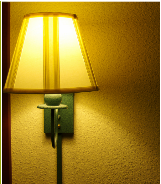
Psalm 119:11 I have hidden your word in my heart that I might not sin against you