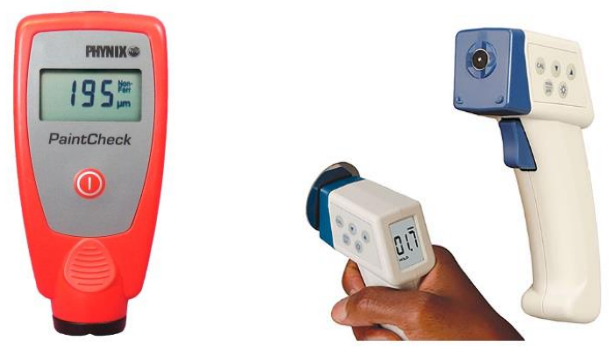
Figure 3: Digital Thickness Gauge (Shoe or Gun type)

The Electronic or Digital Thickness Gauge is the most accurate and easiest to use (Figure no.3). Electronic gagues can also store data and perform averaging calculations.