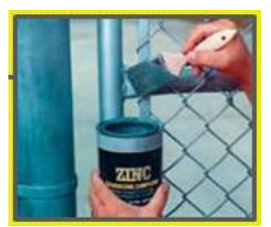
Figure 6: Zinc - Rich Paints

The coating thickness for the paint must be 50% more than the surrounding coating thickness, but not greater than 4.0 mils (100 um), and measurements should be taken with either a magnetic, electromagnetic, or eddy current gauge to ensure compliance.