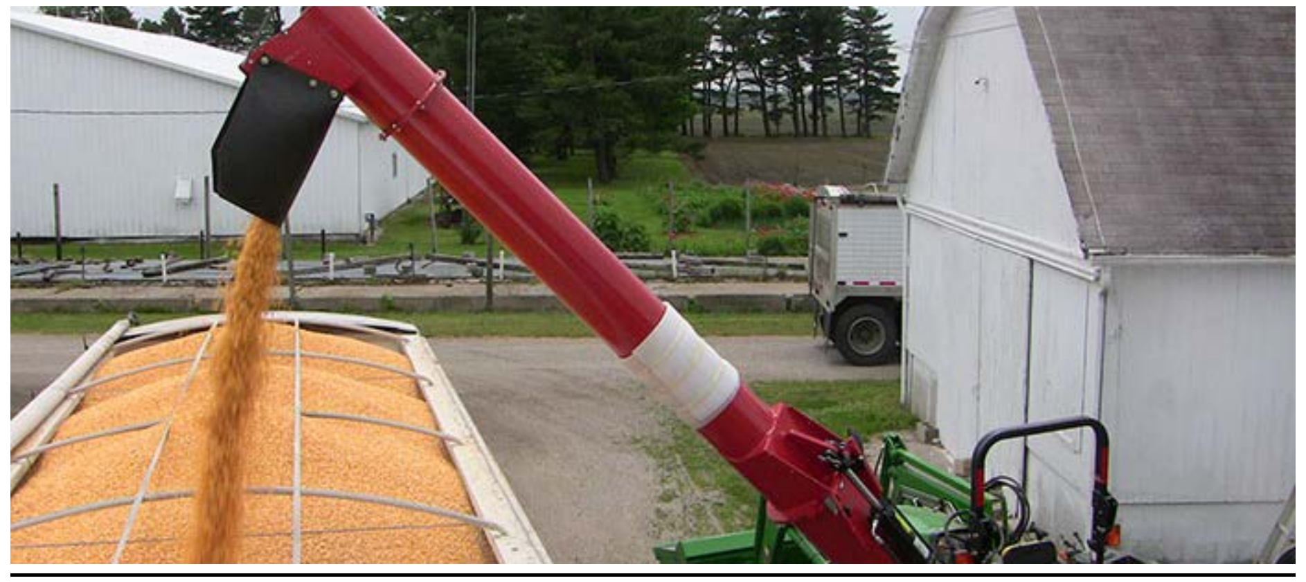
Practical Procedures for Sampling Grain at Farm Sites and Remote Locations

Use a container (a large coffee can will work) to sample grain from a moving stream of grain. Tailgate sampling will draw a reasonably representative sample as grain is loaded/unloaded from a combine to a truck/wagon or from a truck/wagon to a bin.