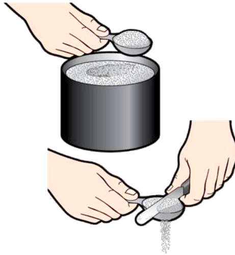
dry measuring cups