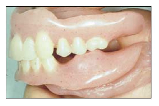
Fig 12 Registering CR with a pivotal appliance

The occlusion of the dentures that will be 'ideal' for the patient is the one which will limit the tilting of the dentures and so minimalise disruption to the peripheral seal, risking instability. As stated this occlusal prescription will take into account the patient's denture bearing tissues and their chewing pattern.