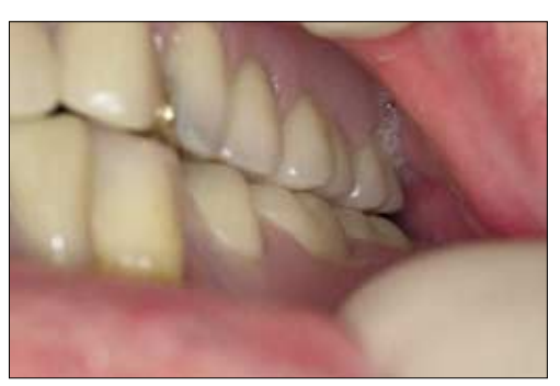
Fig 6 Lack of occlusion after 6 months