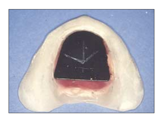
Fig I Ib Gothic arc trace arrowhead

new occlusal vertical dimension (OVD) and to provide occlusal stability. When all adjustments have been made and the patient has been wearing the appliance comfortably for a period, it is a simple procedure to register centric relation with a registration material placed before and behind the pivots. Pivotal appliances may be made on acrylic bases, or from the patient's previous dentures. It may be wise to make a copy of the patient's denture with which to make the pivotal appliance. It will then be possible to return the original denture intact to the patient.