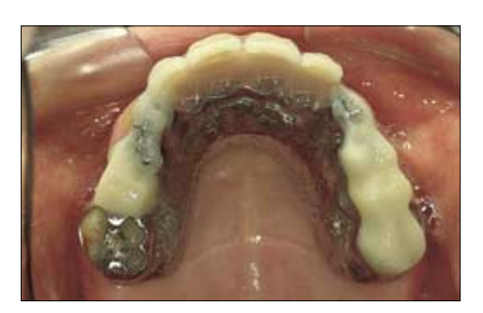
Fig 2 Hybrid prosthesis

sion, sometimes at a raised occlusal vertical dimension. If a partial denture is tooth supported then the design of the occlusion provided by that prosthesis should be to 'conform' with and be complementary to the existing occlusion. The only exceptions to this would be 'rehabilitative' prostheses, which are occlusal diagnostic splints (Fig. 1) and hybrid prostheses (essentially overdentures) (Fig. 2). The difference between the two is that the splint is not intended to be definitive whereas the hybrid prostheses is. Conventional wisdom indicates that the dentist must determine the patient's ability to withstand a raised occlusal vertical dimension with a temporary (diagnostic) prosthesis prior to prescribing the definitive denture/prosthesis.