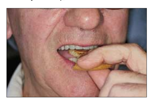
Fig 10 Diagnostic biscuit

If the re-organised approach is to be used; the next question is whether there is a need for a pre-treament phase of splint therapy. If so, copies of the patient's old dentures will be converted into splints that can be used to establish a new jaw relationship (vertical, horizontal or anterio-posteriorly).