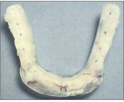
Fig I Occlusal diagnostic appliance (stabilisation splint)