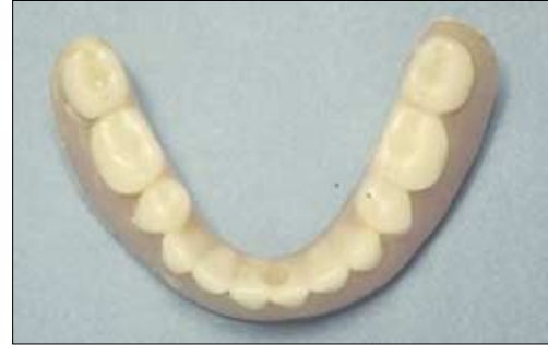
Fig 7b Too large an occlusal table