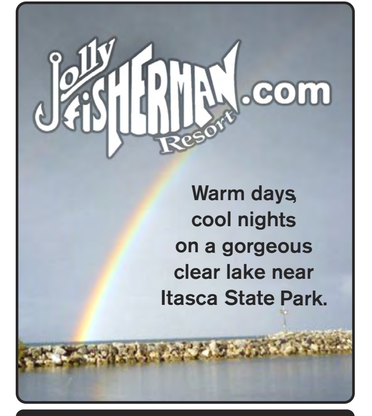
Free paddle boarding, kayaking, canoeing, bonfires, rainbows&fun!