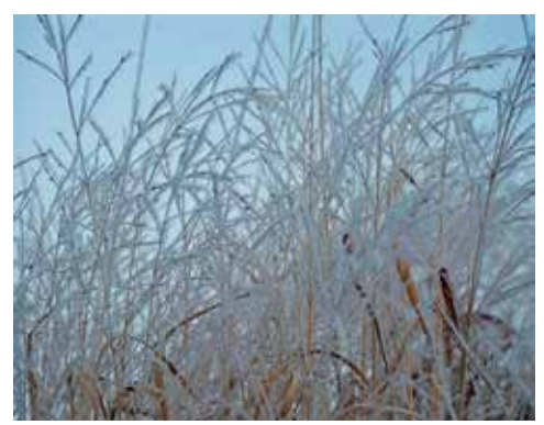
Big bluestem in winter

Several years ago as an intern at the Refuge I would lead hikes for field trip groups. Just outside the main doors of the Refuge, I could readily find three of the most iconic tallgrass prairie plants: Andropogon geradii (big bluestem), Elymus canadensis (Canada wild rye) and Sorghastrum nutans (Indian