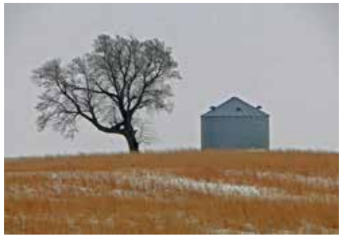
LANDSCAPE - Amber Waves By Tom Moss