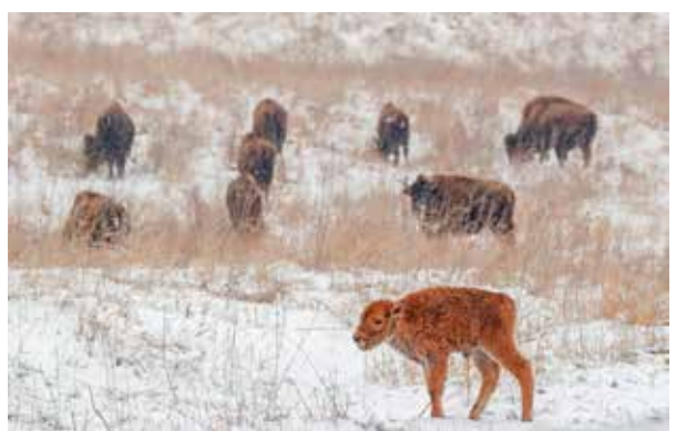
BISON - Baby Bison Born during Spring Snow Storm By Sack Pephirom