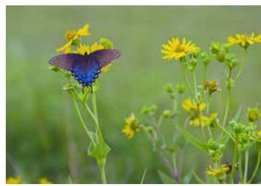
OTHER WILDLIFE -Eastern Tiger Swallowtail By Warren Terpstra