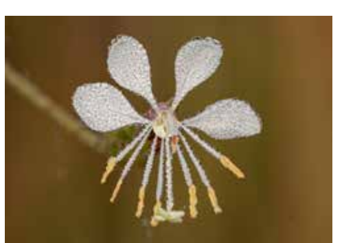
PLANTS - Dewy Flower By Denise Keys