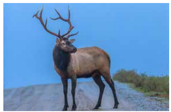
ELK - Crossing Guard By Dale Bales