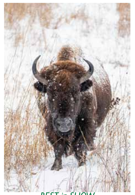
BEST in SHOW Bison - Staring at You By Sack Pephirom