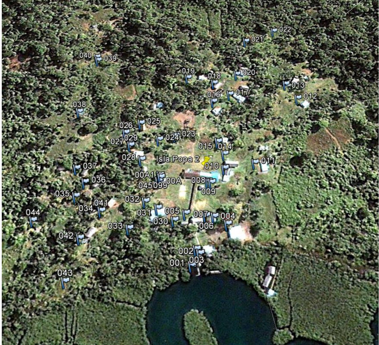
Figure 1: Aerial View of Isla Popa II with GPS Waypoints

member from each household. The questionnaire will be aimed at recording an estimation of each household's water usage to be used in the sizing of catchment tanks to homes. Additional topics will be finalized prior to travelling.