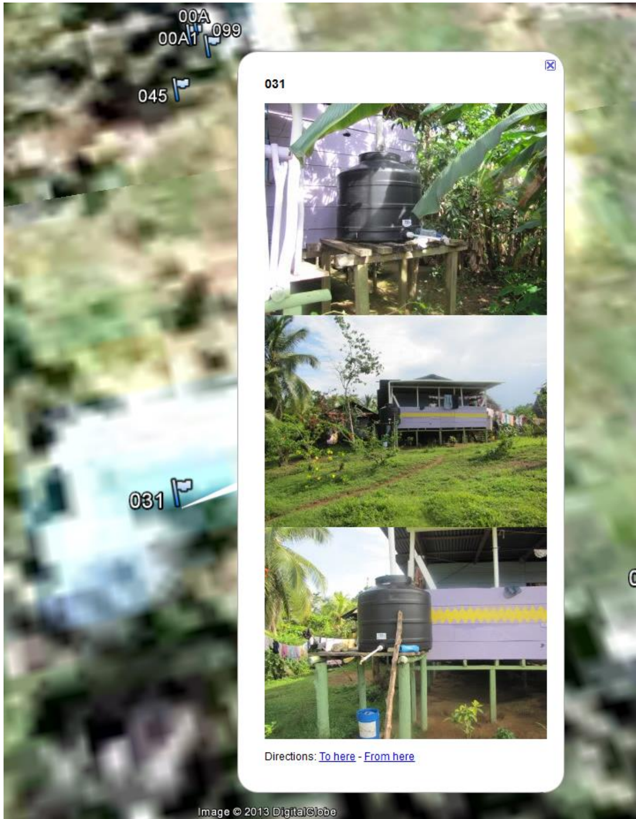
Figure 3: Additional Photos of Marker 31 as Displayed in Google Earth