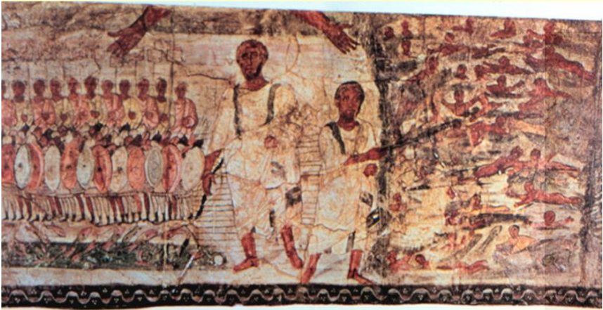
Dura-Europos synagogue painting: Moses and the Hebrews crossing the Red Sea, pursued by Pharaoh: 303 B.C. - 256 A.D.

“And Miriam and Aaron spake against Moses because of the Ethiopian woman whom he had married: for he had married an Ethiopian woman.” – Numbers 12:1