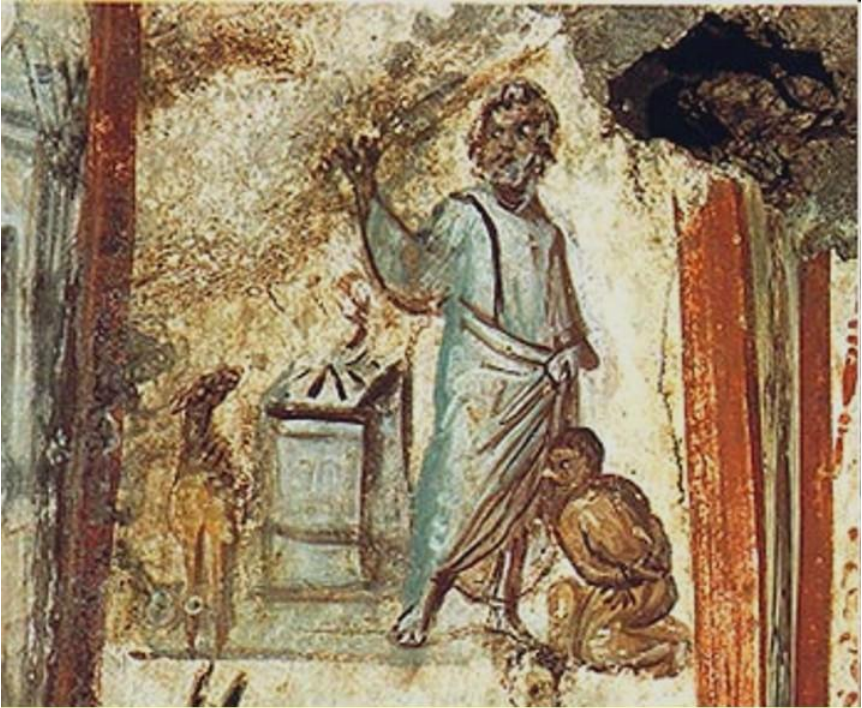
Fresco from the Via Latina Catacomb, Rome (cubiculum C), painted about 320 A.D. Abraham raises his sword to slay his son Isaac.

Cush was the father of the Cushites... a black nation. Nimrod was a Cushite, who founded Babylon, which means that Babylon was a Cushite empire. Abraham was called out of Ur, which was located within the Cushite empire known as Babylon. Chances are that Abraham was a person of color.