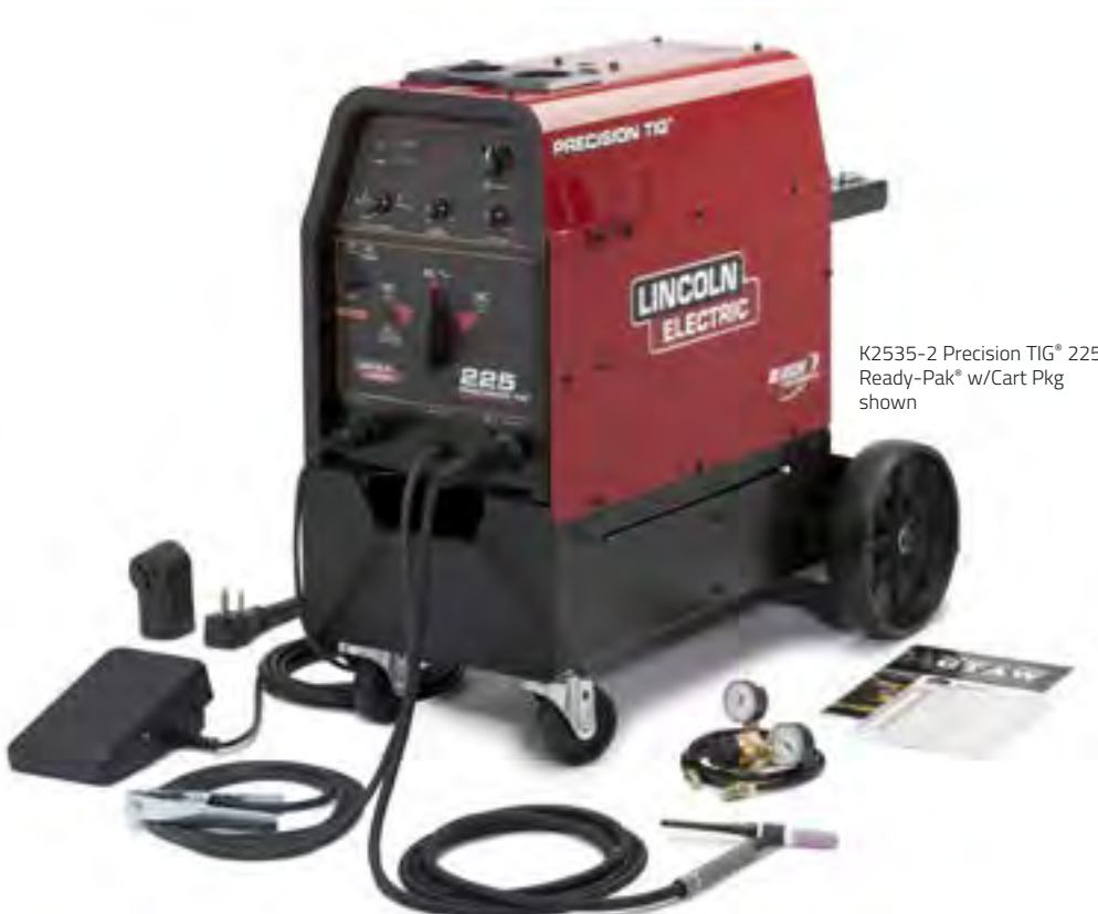
K2535-2 Precision TIG® 225 Ready-Pak® w/ Cart Pkg shown

Also offers outstanding stick welding capabilities, including the use of up to 5/32 in. (4.0 mm) electrodes – even with Fleetweld® 5P+ (E6010).