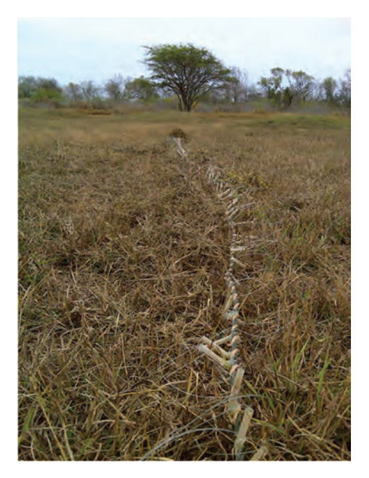
Figure 7. Noose rope.

The bow net (Northwoods Limited, Rainier, Washington) is a 152-cm diameter nylon net mounted on a circular, folding aluminum frame. The bow net was staked to the ground in an open position (forming a half circle) and sprung closed by a battery-operated remote trigger (fig. 8). In order to capture a bird with the bow net, the bird must walk into the target area of the opened bow net. A dummy bow net (permanently secured in the open position) was placed for 2 days at each