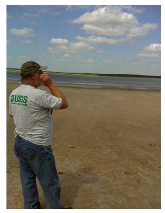
Figure 6. East Lake, a naturally occurring saline lake, in Willacy County, Texas.

Grantham (2011) reported that the cool season (November–February) for Corpus Christi, Texas in 2010–11 was colder and drier than average. These conditions may have altered foraging and roosting habitats for Long-billed Curlews in southern Texas. Southern Texas had 2.24 cm less rainfall during the cool season compared to historical averages (1950–2011). Rainfall in November and December 2010 was 1.85 cm and 2.46 cm below average, respectively, and average