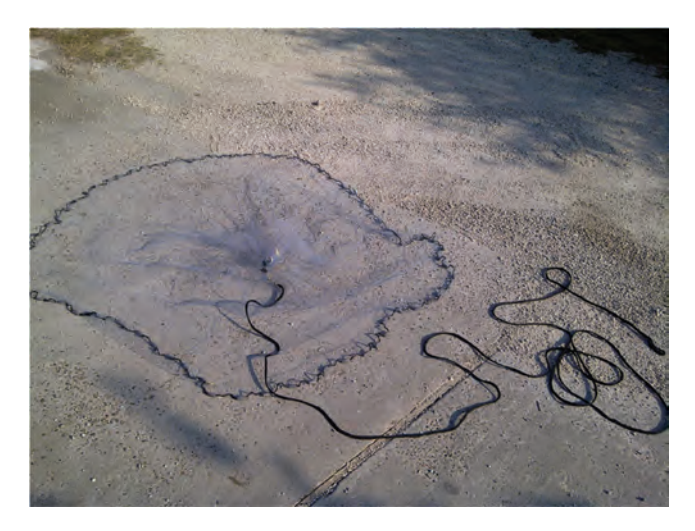
Figure 9. Cast net.

The cast net was a hand-held circular net (2.4-m diameter) with numerous small weights attached to the perimeter (fig. 9). Cast nets are used by fishermen to catch small baitfish and are available commercially at most sporting goods stores. The net is flung over the bait, and a long cord attached to the wrist allows the fisherman to close and retrieve the net along with its contents. Cast nets were evaluated because of the ability to get close (within 3 m) to foraging curlews in urban environments. Long-billed Curlews were approached by a single person carrying the cast net, who advanced slowly and indirectly toward a foraging or resting Long-billed Curlew. When the curlew was within reach (about 4 m away), the net was cast quickly toward the bird.