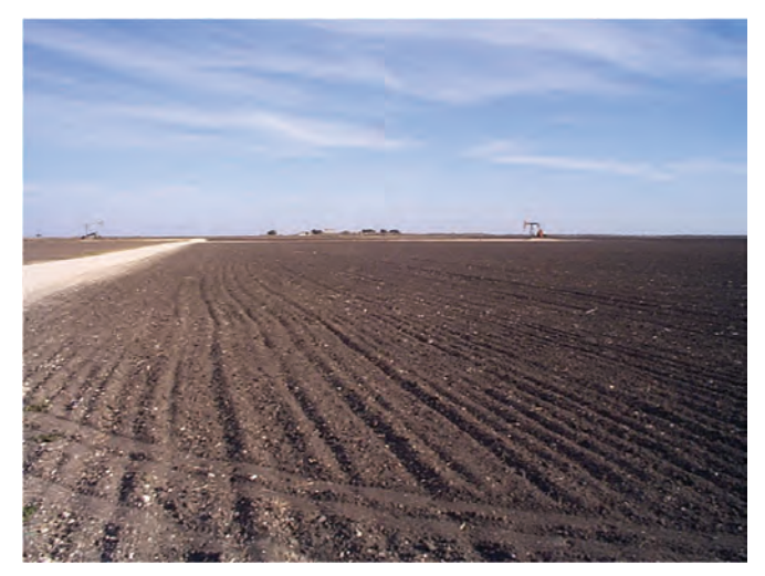
Figure 4. Farmland.

Long-billed Curlew research was conducted in a variety of habitats in southern Texas, including barrier island beach, urban and suburban mowed grassland, farmland, salt marsh, and inland saline lakes (figs. 2–6). Beach habitat (fore beach/ surf and back beach with associated coppice dunes) on Padre Island was characterized by washed up mats of brown algae ( Sargassum ), beach debris, and sparse vegetation, including morning glory ( Ipomoea pes-caprae and Ipomoea imperati )