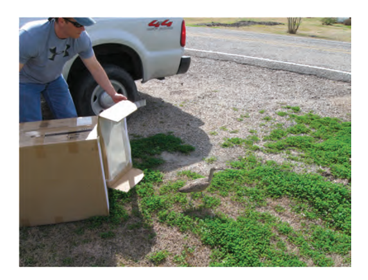
Figure 14. Release of Long-billed Curlew from a holding box.

To ensure that banded birds were unharmed and did not suffer from capture myopathy (an often fatal condition caused by over-extension of muscles because of stress from capture and improper restraint) (Purchase and Minton, 1982; Gratto-Trevor, 2004), Long-billed Curlews were placed in a holding box (73 cm \times 66 cm \times 35 cm) and observed for at least 15 min before being released in the vicinity of the capture. A supply of Diazepam was available for treatment of muscle myopathy (Piersma and others, 1991), but it was unnecessary for any of the birds that were captured. When the bird was standing and moving about in the box, the door was opened to allow the bird to walk out freely and fly away (fig. 14).