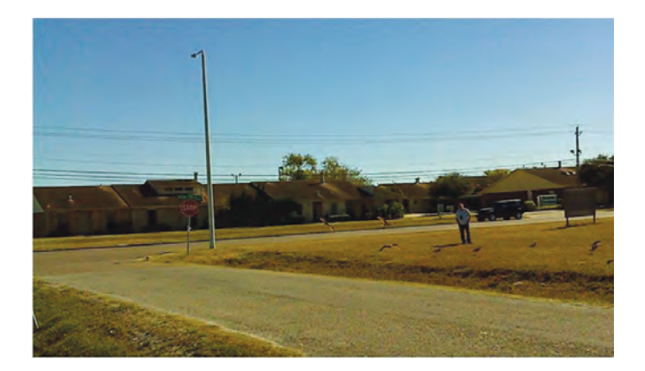
Figure 3. Urban grassland.

Long-billed Curlew research was conducted in a variety of habitats in southern Texas, including barrier island beach, urban and suburban mowed grassland, farmland, salt marsh, and inland saline lakes (figs. 2–6). Beach habitat (fore beach/ surf and back beach with associated coppice dunes) on Padre Island was characterized by washed up mats of brown algae ( Sargassum ), beach debris, and sparse vegetation, including morning glory ( Ipomoea pes-caprae and Ipomoea imperati )