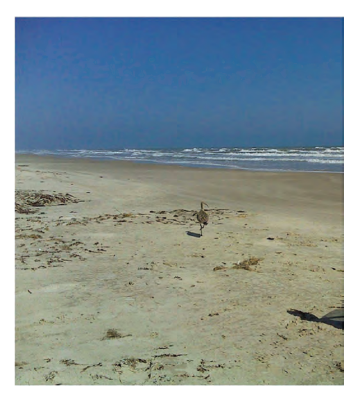
Figure 2. Padre Island National Seashore beach.

The study area was located in two Texas ecoregions. Study sites in Refugio, Nueces, and Kleberg counties were in the Gulf Coast Prairies and Marshes ecoregion (not shown), which extends from Orange County to the Mexico border. Inland study sites in Willacy and Hidalgo counties were in the South Texas Plains ecoregion (not shown; Texas Parks and Wildlife Department, 2005; modified from Gould and others, 1960) (fig. 1). These semiarid study site supports subtropical representatives of native grasses such as Schizachyrium, Chloris, Eragrostis, and Paspalum spp.; however, many grasslands are now dominated by exotic grasses such as buffelgrass (Cenchrus ciliaris), Johnsongrass (Sorghum halepense), Kleberg bluestem (Dichanthium annulatum), and kleingrass (Panicum coloratum). Typical woody vegetation of the region includes honey mesquite (Prosopis glandulosa), live oak (Quercus virginiana), and Texas prickly pear (Opuntia engelmannii).