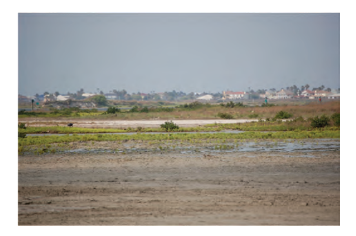
Figure 5. Coastal salt marsh.

idle, plowed fields (some containing stubble, but most were unvegetated), and narrow strips of mowed grass. Inland salt lakes were large (200–300 ha), naturally occurring, shallow, hypersaline lakes surrounded by grassland and Tamaulipan thornscrub vegetation, a subtropical, semiarid vegetation type (Crosswhite, 1980). These saline lakes are free of any aquatic vegetation and at times host large numbers of Brine Shrimp ( Artemia spp.), attractive to many waterbirds.