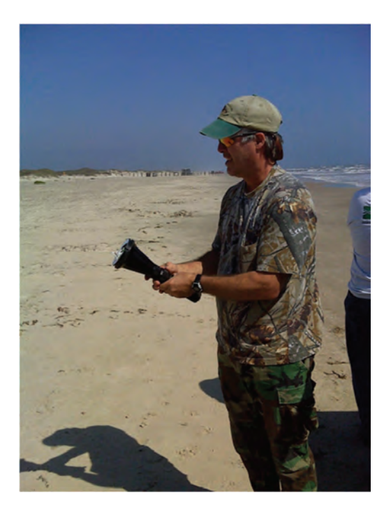
Figure 11. Super Talon Netgun.

to launch a circular net. The net was 4.8 m in diameter and launched at a speed of about 5 meters per second. The Talon was used on foot or from a vehicle, in the same manner as the Coda Netgun (fig. 11).