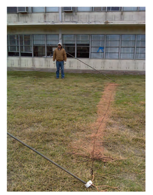
Figure 12. Whoosh net.

The whoosh net (Hawkseye Nets, Virginia Beach, Virginia) is a 7.6 m \times 4.8 m net with a mesh size of 6 cm \times 6 cm (fig. 12). The whoosh net was propelled by bungee cords