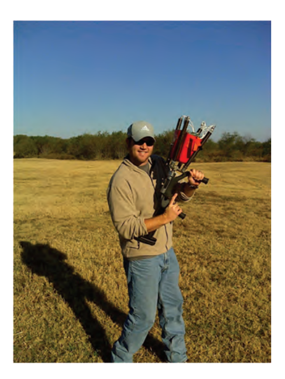
Figure 10. Coda Netgun.

The netgun technique can be successful, yet there is a chance of injury or mortality to birds that are struck by a net