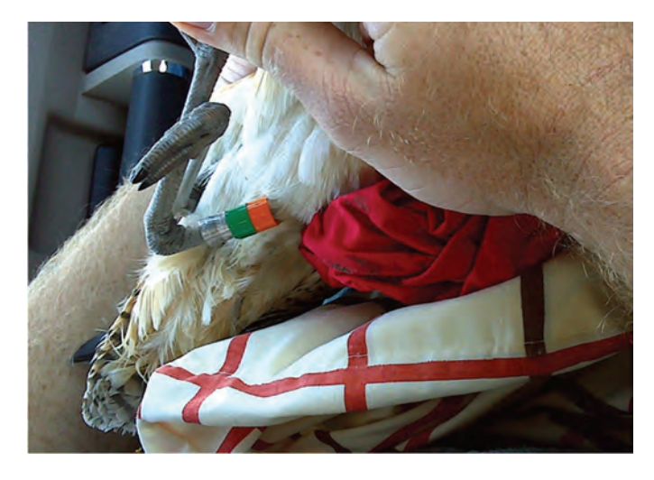
Figure 15. Band types and colors placed on Long-billed Curlews.

Seven Long-billed Curlews were captured in the northern counties and fitted with size 5 bands (fig. 15). The northernmost capture was in Refugio County, and the two southernmost captures were in Kleberg County. All others were caught in Nueces County. No curlews were captured in Kenedy or Cameron counties to the south.