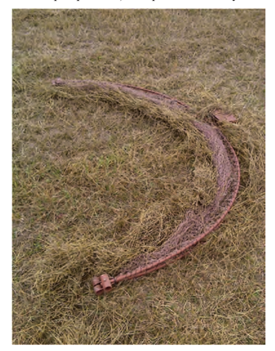
Figure 8. Bow net.