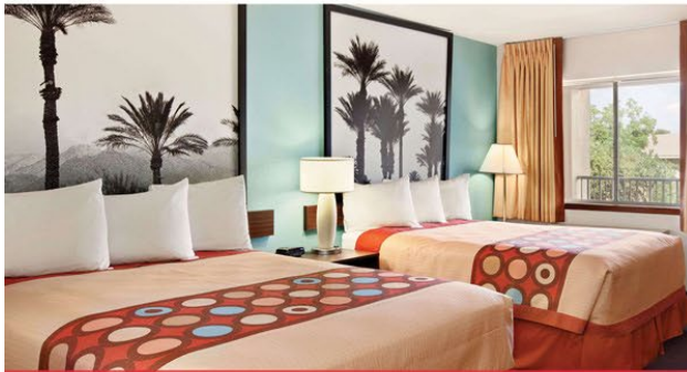
DELUXE DOUBLE ROOM