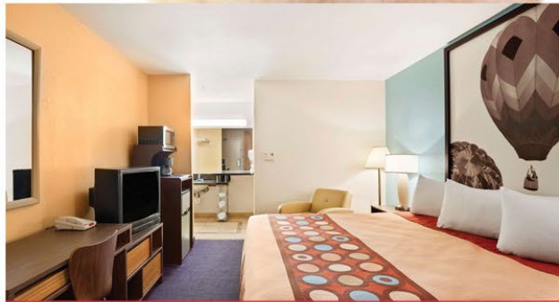
DELUXE KING ROOM