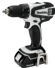
Cordless Power Tools & Batteries