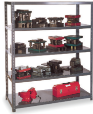
Shelving & Storage Racks