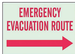
Evacuation Equipment & Signs