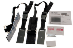
Earthquake Safety Straps & Fasteners