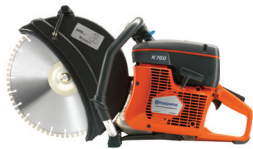
Concrete Power Cutters

For more information, call your local branch or visit granger.com/emergency