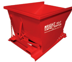
Self Dumping Hoppers