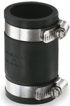
Plumbing Flexible Fittings