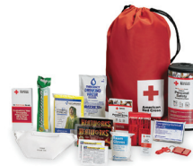
Disaster Survival Kits