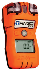
Gas Leak Detectors