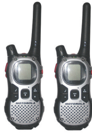
Two-Way Radios & Accessories