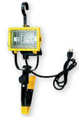
Hand & Portable Lamps