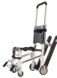
EMT & Rescue Supplies