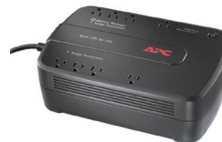
Backup Power Systems