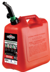
Gas and Safety Cans