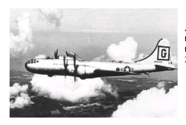
A 305 BW B-29, 1951—Still using the G they had used in WW II, but this time the square designation of the 2nd Air Force.

growing cold war with the Soviet Union and Communist China. The wing was initially equipped as a B-29 unit with refurbished WW II aircraft from a storage depot in Arizona. Staffed by a small core of active duty personnel coming from other SAC and Air Force units, most personnel were Reservists recalled for Korean War service, representing the entire range of WW II experience. They were soon joined by some of the first B-29 combat crews to return from the Far East. Col Elliot Vandevanter, a decorated bomber pilot and 385th Bomb Group commander from World War II assumed command.