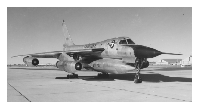
Convair B-58A "Hustler." A truly powerful and fast bomber—capable of Mach 2+ speeds, The 305 BW was one of only operational two wings equipped with it.

The 305 BW was in fact undergoing a double conversion as the bomb squadrons were preparing to receive Convair's B-58 Hustler, USAF's first supersonic bomber.