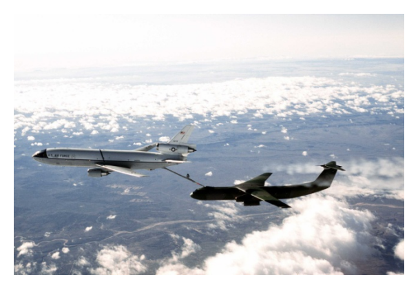
First 305 AMW Joint refueling training mission, October 1994. The wing inherited a mixed bag of "white top" KC-10s, Euro I C-141Bs, and a fleet standard AMC gray for both planes.

Based on a USAF Chief of Staff directed review of unit lineage and honors, the 305 ARW was selected for retention in the active force even as the USAF downsizing was in progress due to its bestowed World War II heritage and peerless readiness in the Cold War. In a 28 February 1994 announcement, the 305th Air Refueling Wing was designated for transfer (without personnel or equipment) to McGuire AFB, New Jersey on 1 October 1994. Because the KC-10 mission was moving to McGuire as well, it was also redesignated as the 305th Air Mobility Wing, taking over the personnel and equipment of the inactivated 438th Airlift Wing and flying the C-141B Starlifter and KC-10 Extender.