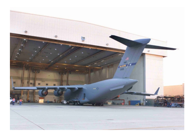
Roll out of "The Spirit of New Jersey" 2004. The first dedicated C-17 at McGuire.

Another aircraft change was in the works for the Wing in the early years of the new century. With a high operations tempo and a C-141B phase-out in progress that eventually inactivated two squadrons--the 18 AS and the 13 AS in 1995 and 2001 respectively--all in anticipation of the phase-out of the C-141B in September 2004, McGuire began building more than $80B in C-17 support facilities in 2002. In September, 2004, the 305 AMW had the honor of being the last active duty C-141B wing. In its place, the C-17A Globemaster III took over the wing's primary airlift mission.