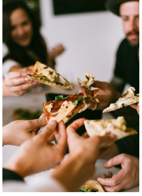
A group shares a pizza.