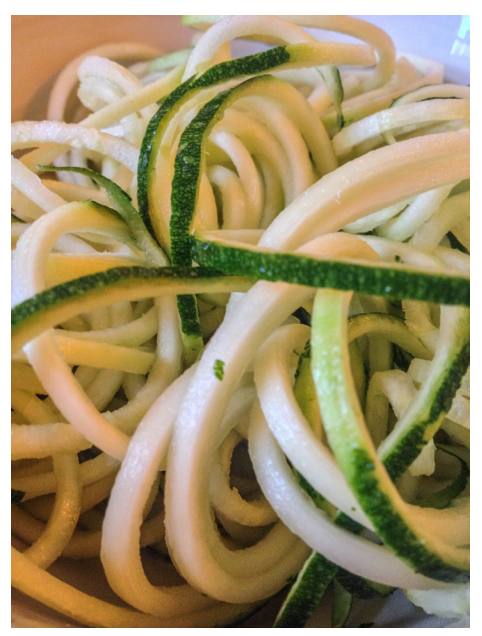
Zucchini spirals.