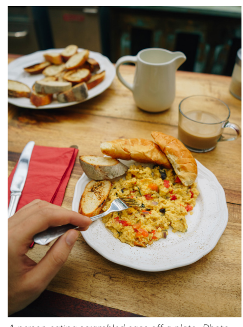
A person eating scrambled eggs off a plate.. Photo by Gian Cescon via Unsplash