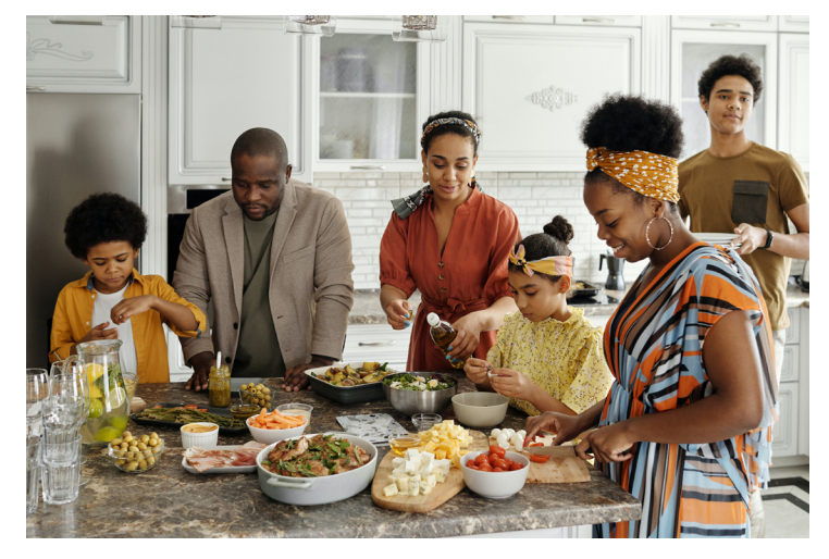
A family prepares a meal together around a kitchen counter.

• Regular family meals lower the rates of obesity and eating disorders in children and adolescents, most likely because family meals are typically more nutritious than meals eaten alone or outside the home. A Harvard study found that families who eat together are twice as likely to eat five servings of fruits and vegetables as families who do not eat together.