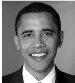
PAGE 4 ON BARACK OBAMA