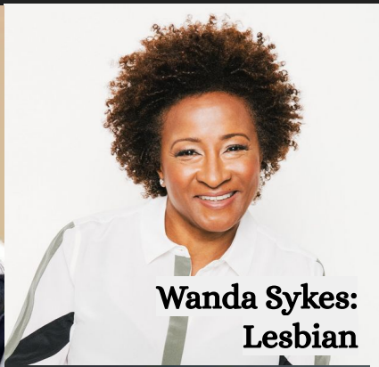
Wanda Sykes: Lesbian