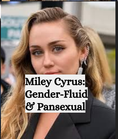
Miley Cyrus: Gender-Fluid & Pansexual