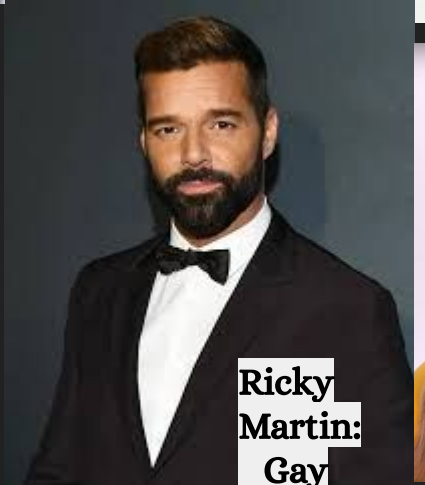
Ricky Martin: Gay