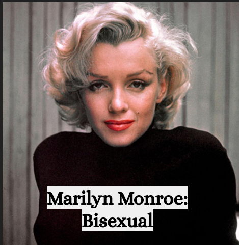
Marilyn Monroe: Bisexual