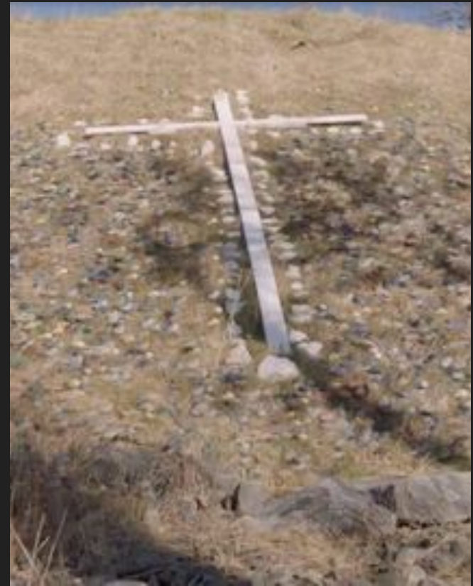
Memorial Cross on Hart Island, NYC to mark mass graves for AIDS casualties.

https://www.hiv.gov/hiv-basics/overview/history/hiv-and-aids-timeline