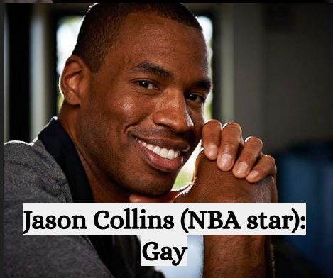
Jason Collins (NBA star): Gay