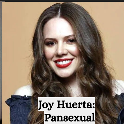
Joy Huerta: Pansexual