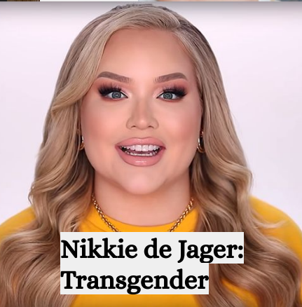
Nikkie de Jager: Transgender