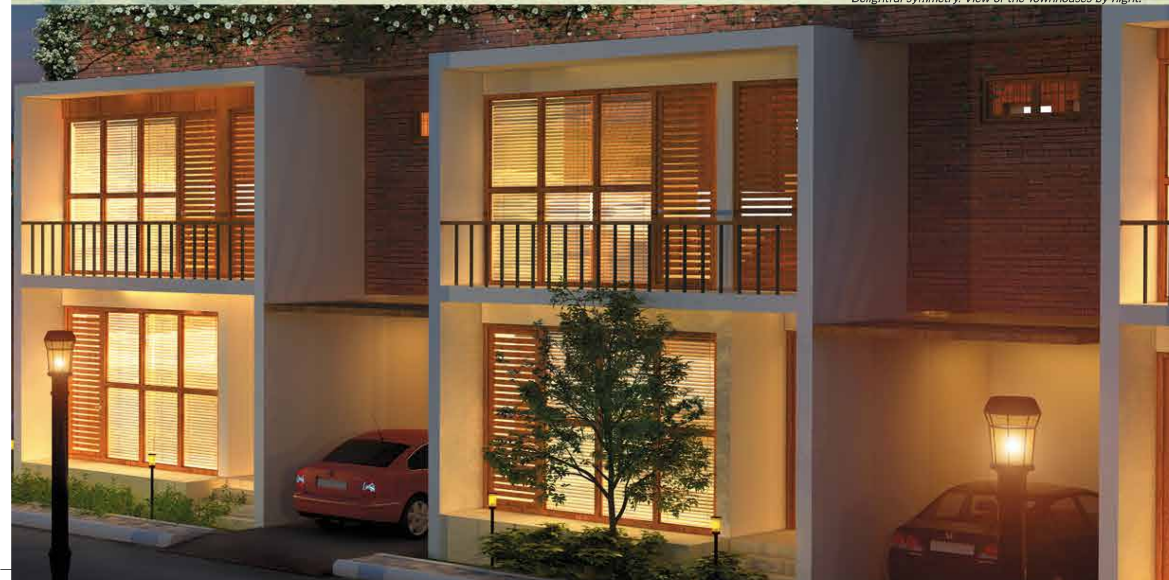
Delightful symmetry. View of the Townhouses by night.

Laid in delightful symmetry, the Townhouses come with spacious bedrooms (with attached balconies that are just as spacious), an airy living room and dining space, a handy utility room and a covered parking area.