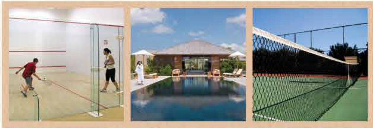
Fit for the job. Fully equipped fitness centre.