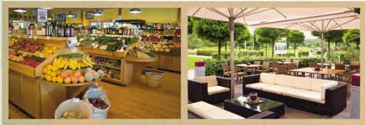
Shopping blockbuster. Shopping complex-cum-multiplex.