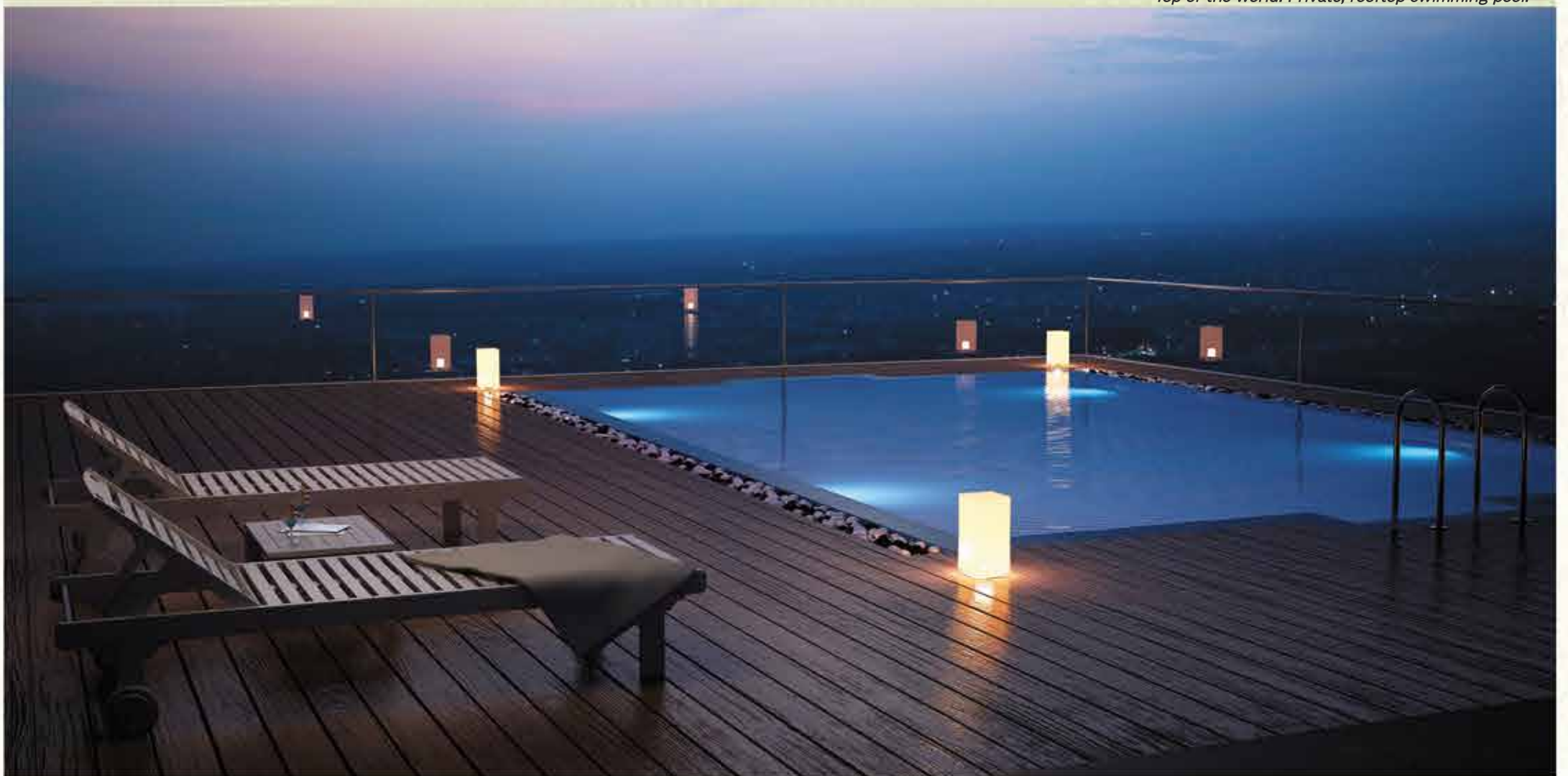
Top of the world. Private, rooftop swimming pool.

The 2-storied villa comes with airy living rooms (with as much natural light as can possibly stream in), a spacious dining room (you can throw a banquet in), enormous walk-in closets (that virtually are rooms in themselves), a puja room and a separate servant's room.