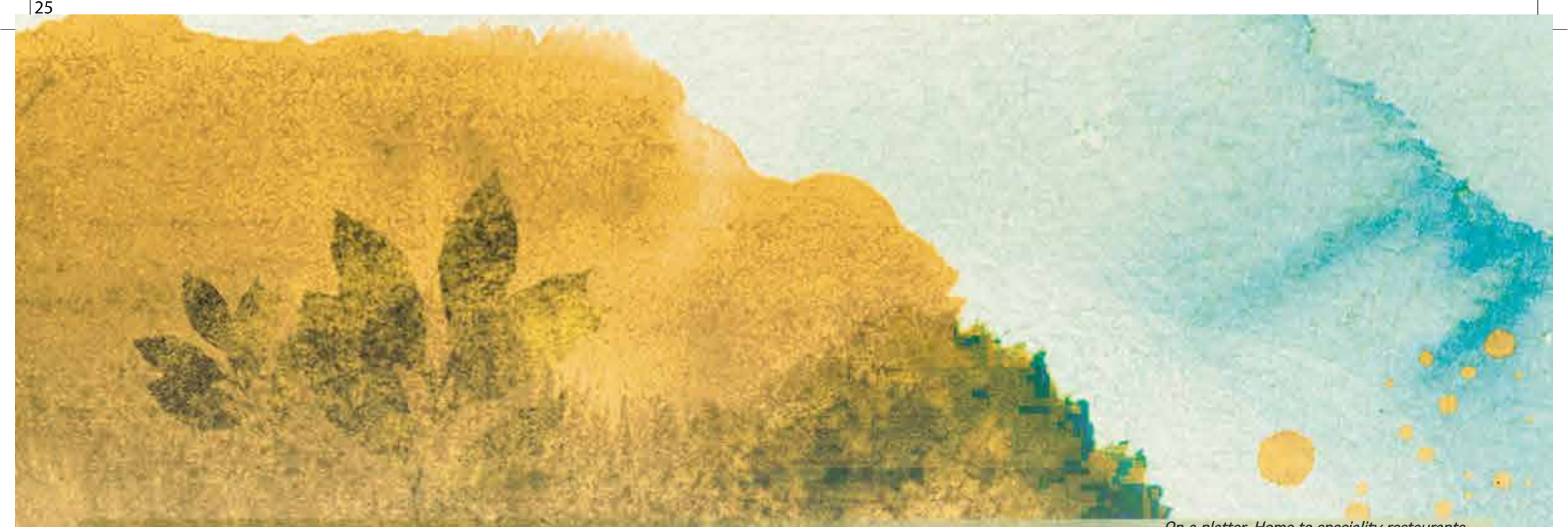
On a platter. Home to speciality restaurants.