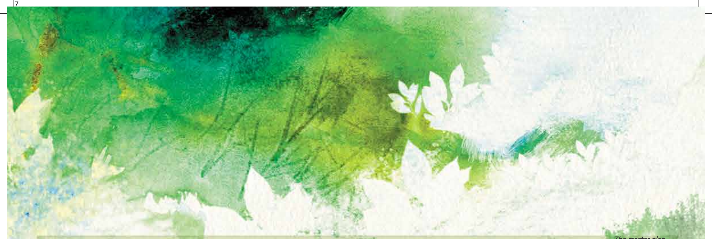
The master plan.