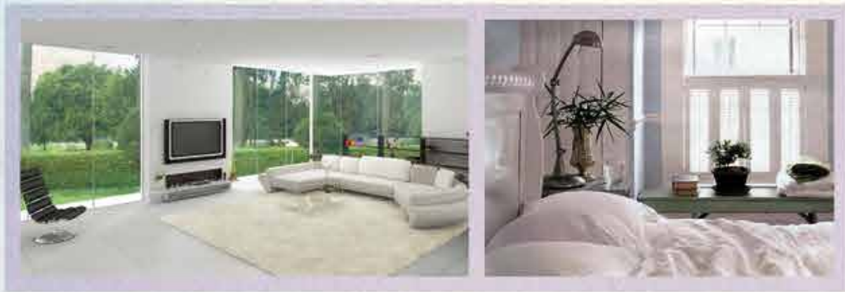
White space. Living rooms with ample space and light.