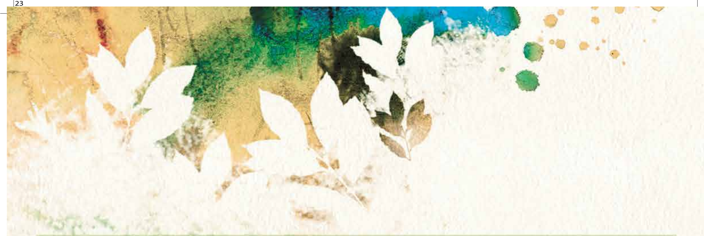
Pamper your senses. Wellness club and spa center.