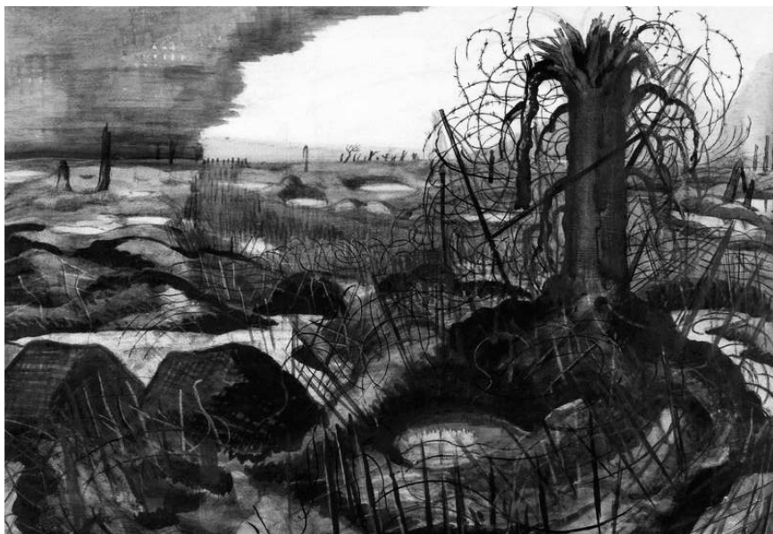
Paul Nash. Wire , 1918.

WORKING WITH DA VINCI STUDENTS LETCWORTH FESTIVAL 2015