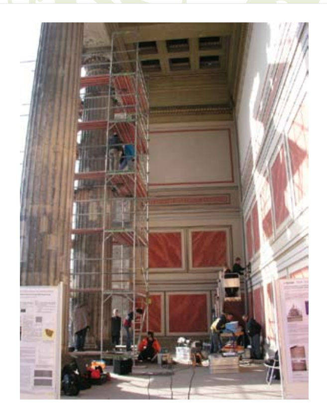
Different investigation methods performed (radar, impact-echo, ultrasound)

In accordance with the SSP work programme applied to the cultural heritage area, this objective was expected to be applied in particular to several initiatives being subsidised within 'Culture 2000', and to EU regulations, in particular the Structural Funds, the Water Framework Directive and the measures to be adopted for the protection of cultural heritage, the 'Clean Air for Europe' (CAFE) Directive, which includes the effects of air pollution on historical buildings, the Directive on the return of cultural property removed from any Member State illegally, and the Regulation governing exports of cultural property to third countries.