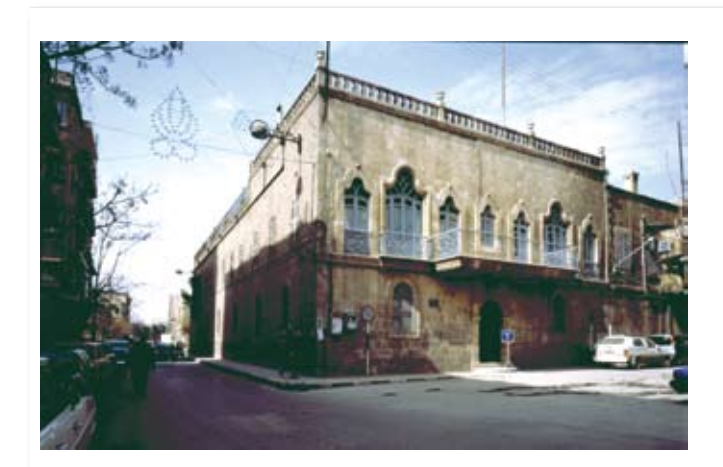
Building in Alep, Syria

Today, with the experience gleaned from the previous research Framework Programmes, which included research into 'physical' heritage, it is possible to take stock of progress and of the major impact made by the European Commission in this area of applied research. The 120 or so projects backed – of which a number related to FP6 are still being implemented during the first years of FP7 - brought together more than 500 institutional players across Europe and beyond. These included a large number of organisations working in research and technology development (universities, research centres, SMEs, etc.) as well as the direct users of the results obtained, such as museums, institutes, galleries, archives responsible for the protection and management of heritage as well as private-sector bodies.