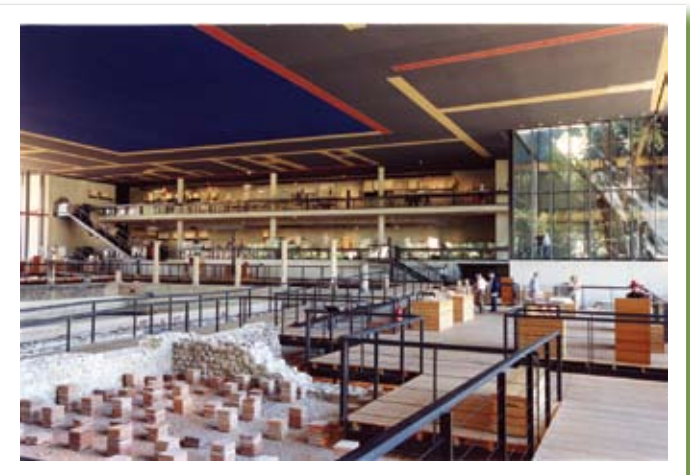
Vesunna archaeological site, Périgueux, France

The APPEAR project (Accessibility projects – sustainable preservation and enhancement of urban subsoil archaeological remains) aimed to provide both decision-makers and professionals responsible for the management of archaeological heritage with a set of best practices drafted on the basis of a detailed inventory of case studies. As such, the APPEAR guide enables those involved in urban archaeology to plan out and implement the measures needed to enable public access to and awareness of relics, while guaranteeing optimum protection of the latter. This project ran for three years (2003–05) and was supported under FP5's key action – 'The city of tomorrow and cultural heritage'.