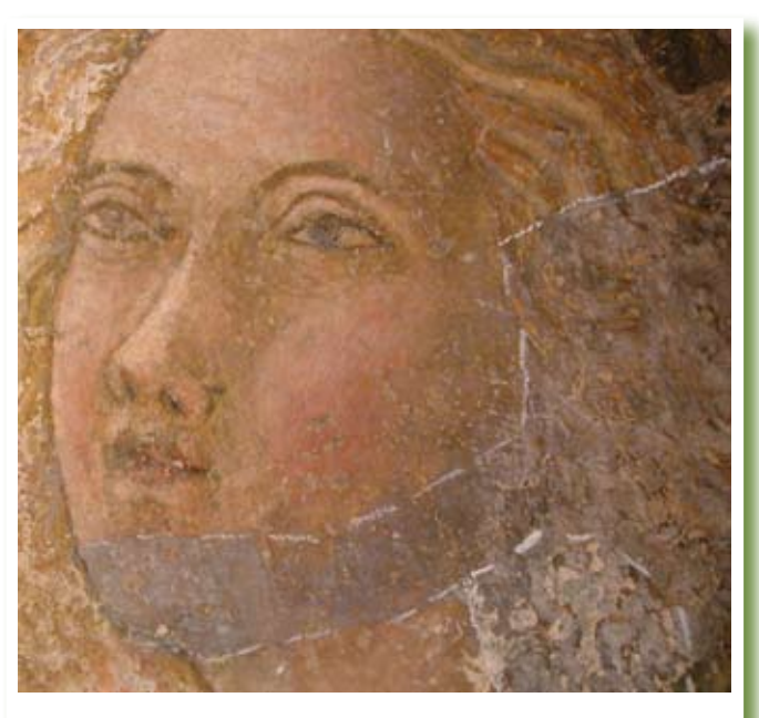
Laser cleaning where pigments are present is still an open issue: here laser cleaning of deteriorated frescoes was demonstrated at the S. Maria della Scala in Siena using the photo-thermal effect called 'laser spallation'

In this context, the two first open calls for proposals of FP7 were especially related to diagnosis, assessment and monitoring technologies and tools, including, for the second call, the development and application of monitoring and modeling tools adapted to the near- and long-