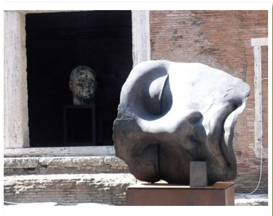
Sculptures of Igor Mitoraj, Trajan Market, Rome

Some other projects addressed the protection of silver collections from tarnishing, the treatment of wooden cultural objects from insect pests without using toxic chemical compounds (see box on SAVE ART, 'Saving works of art', page 11), or the analysis of bone objects degradation as an indicator in the deterioration of archaeological cultural property. Finally, another project developed a novel molecular tool for analysing unknown microbial communities of mural paintings and their application in the conservation/restoration practice.