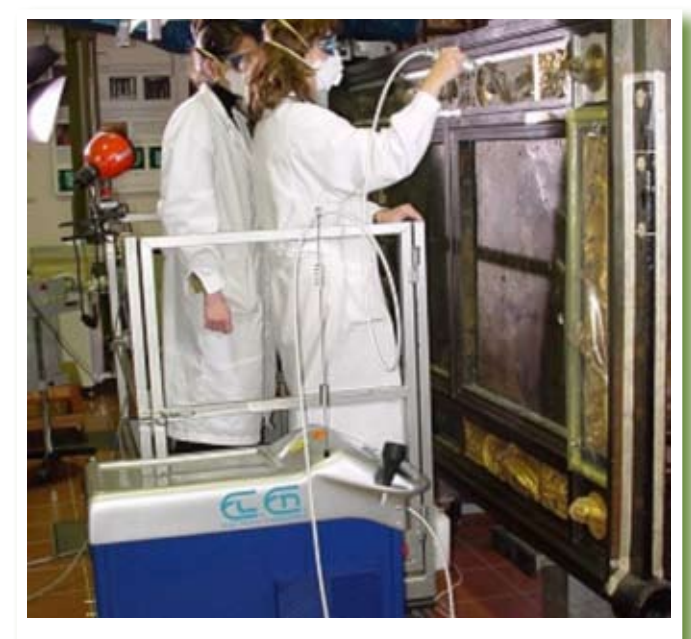
Laser cleaning of gilded bronze is today a well-established technique: the first demonstration has been the cleaning of the renaissance masterpiece by Lorenzo Ghiberti Gates of Paradise

cultural heritage in the urban setting.<sup>20</sup> In addition, the specific Cooperation programme targets: