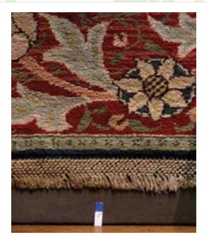
A LightCheck strip placed next to carpet

To facilitate assessment of the impact of light on works of art and to identify optimum lighting conditions, a European team was set up to work on the LIDO project (A light dosimeter for monitoring cultural heritage: development, testing and transfer to market). The objective of this project was to design a dosimeter that would be easy to use and robust, offer good value for money and meet with the very specific day-to-day needs of experts working in cultural heritage. Following both laboratory and fieldwork, for which measurements and analyses were carried out in museums in London, Paris, Berlin, Florence and Prague, two dosimeters were produced: LightCheck® Ultra (LCU), which is used to monitor highly light-sensitive objects, and LightCheck® Sensitive (LCS), which is applicable for more durable objects (and longer exposure times). These devices are now available on the market. This project, which was carried out from February 2001 to January 2004, was supported under the key action of FP5 - 'The city of tomorrow and cultural heritage'.