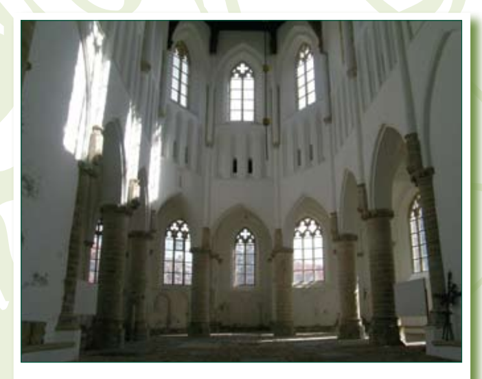
Damage to plaster due to salt, RH cycles leading to irreversible dilation

As to the result of the second call for proposals, projects demonstrated some continuity as regards research undertaken in previous periods concerning stone, brick masonry, archaeological iron, effects of the environment on indoor cultural property (museums and libraries), vegetable tanned leather. In addition, new materials and areas of research covered environmental research for art conservation applied to the paintings and woodcare.