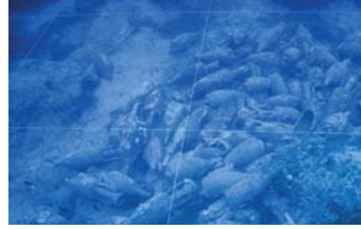
Underwater archaeological site of "Cala Minnola" in Levanzo