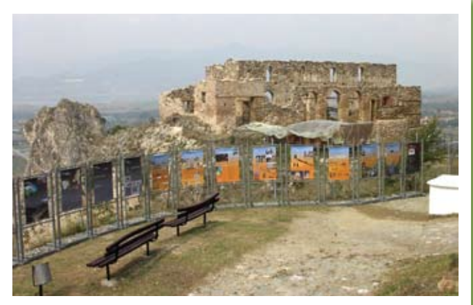
The permanent exhibition, concerning the Castle of Servia (Greece), studied by the EC-FORTMED project, which is located inside this archaeological site