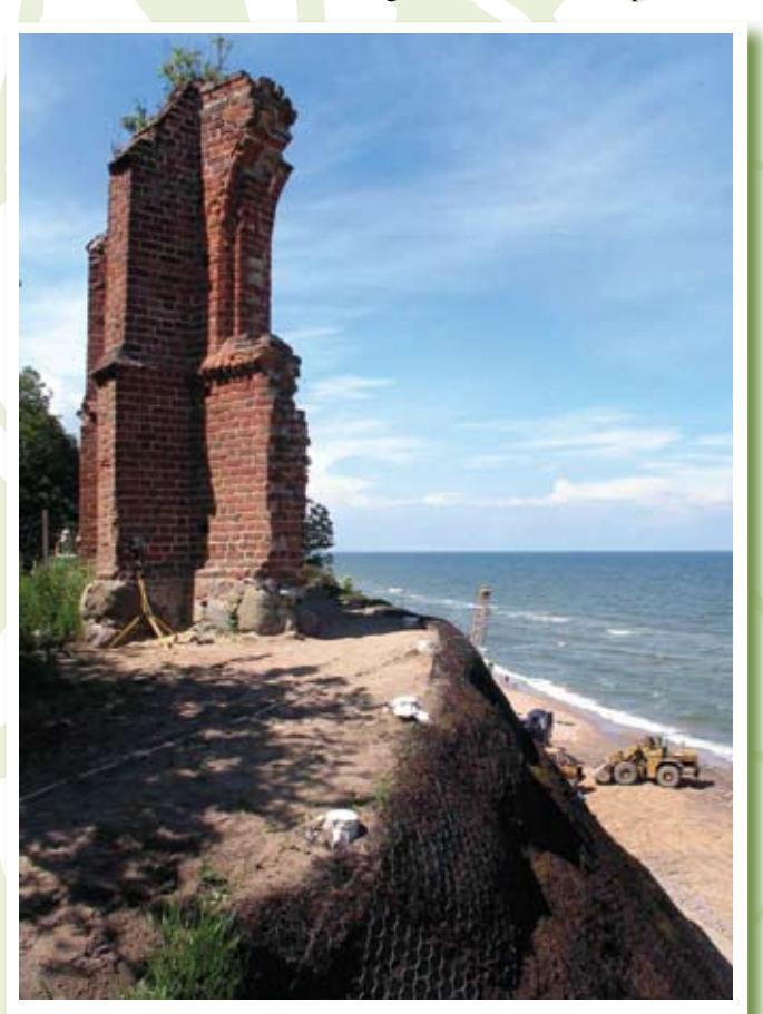
Ruins of the mediaeval church in Trzesacz, at the Baltic Sea, Poland, destroyed by the shift of the coastline

Ultimately, the preservation of cultural heritage brings together the art of building and of creation, culture and beauty, history, memory and identity on one side, and the latest conservation science and technology on the other. In an evolving world, well-preserved works of art that citizens can see and experience represent sources of dreams and innovation, to the benefit of everyone. Conserving such works of art thus implies active research and investigation, illustrating the efforts of all its actors to contribute to a more harmonious, sustainable and human environment. Who could argue with such an enterprise?