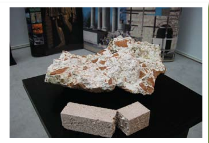
Ancient mortars and new prototypes

Very often, the masonry work of ancient Roman sites is astonishingly well preserved and the mortars used would appear not to have suffered with the passing of the centuries. The Iter project (Isotopic technologies applied to the analysis of ancient Roman mortars) sought to discover why these Roman mortars were more durable than those we use today. Mineralogical and isotopic analyses were carried out on samples taken from the Xanten site in Germany, Villa Traiana in Italy, and Caesarea Marittima in Israel. These tests identified the unique characteristics of the materials used and provided the scientists involved with fresh knowledge of the construction techniques of the time. All of the data gathered, whether historical, mineralogical or isotopic, were entered into a single database. The ingredients and preparation method of the ancient mortar were modelled, leading to the creation of a prototype 'Roman' mortar which was then tested for future use in the heritage conservation and construction sectors. This project ran for 28 months (1 April 2002-31 July 2004) and was funded by the EU's CRAFT programme.