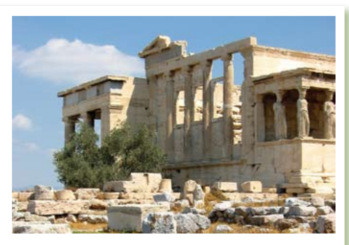
Athens Acropolis, a major site which restoration has been supported by the EU Cultural Programme

as a catalyst for creativity in the framework of the Lisbon Strategy for growth and jobs. The cultural sector is already a very dynamic trigger of economic activities and jobs throughout the EU territory. Cultural activities also help promote an inclusive society and contribute to preventing and reducing poverty and social exclusion. As was recognised by the conclusions of the 2007 Spring European Council, creative entrepreneurs and a vibrant cultural industry are a unique source of innovation for the future. Indeed, cultural industries are an asset for Europe's technological innovation, economy and competitiveness. This potential must be recognised even more and fully tapped. International relations is the third set of objectives. As a party to the UNESCO Convention on the Protection and the Promotion of the Diversity of Cultural Expressions, which entered into force in March 2007 and can be seen as a fundamental step, the EU – having greatly contributed to it – is committed to integrating the cultural dimension as a vital element in Europe's dealings with partner countries and regions. The EU is, and must aspire to becoming even more, an exemplar of a 'soft power' founded on norms and values such as human dignity, solidarity, tolerance, freedom of expression, respect for diversity and intercultural dialogue, values which, provided they are upheld and promoted, can be of inspiration for the world of tomorrow.