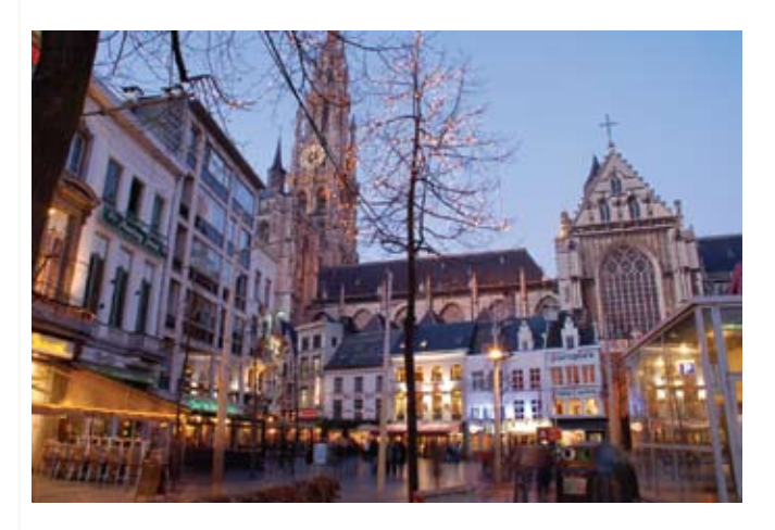
Antwerp Cathedral at night

Alongside the prestigious buildings and monuments which form the core of our urban heritage, Europe's cities are also home to less visible historical quarters which house more ordinary buildings that nonetheless exemplify styles of architecture that were in fashion at different periods of our history. This urban heritage is part of the living and breathing fabric of our towns and cities.