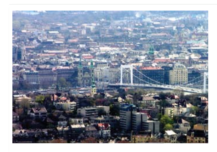
European cities: a complex web of inherited and new construction, cultural heritage is an essential part of our living environment (Budapest)