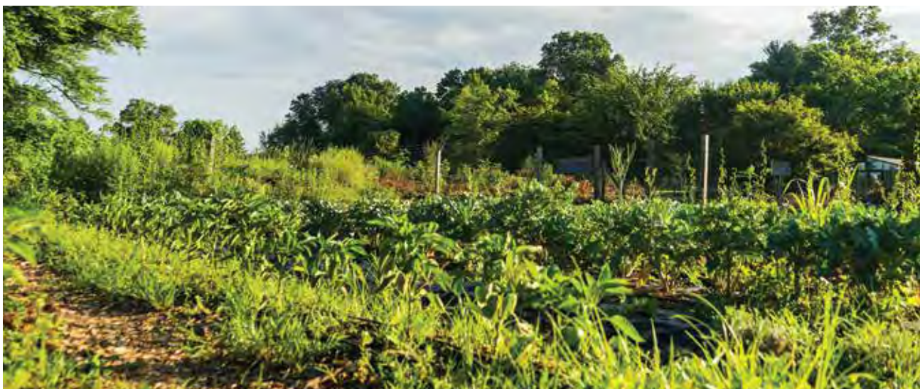
Opposite page, clockwise from top left: summer farm stand; CSA harvest; Haverfarm table at the Spring Festival; tomato harvest; honey harvest