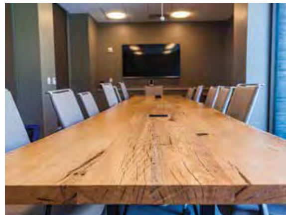
Clockwise from top left: The Quercus macrocarpa (bur oak) outside the library is original to the campus; new landscaping at the Carvill Arch is an integral part of the renovation; a conference table created from a downed Quercus rubra (red oak); tables in the lobby made from our own milled lumber