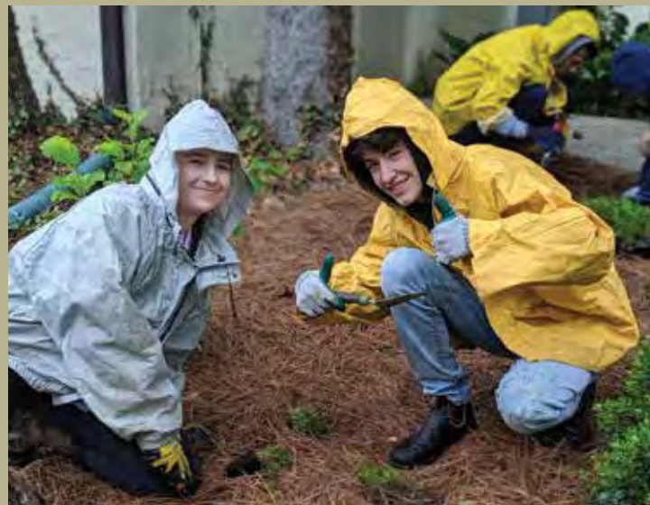
Clockwise from top left: Earth Week tree planting; honeybee hive exploration; tree identification workshop; volunteers plant at The Ira De A. Reid House; Spring Festival plant sale