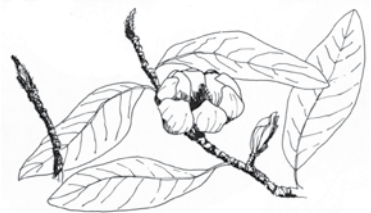
SWEETBAY MAGNOLIA Magnolia virginiana