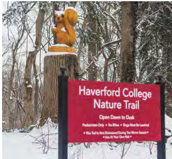
Opposite page: spring on the Nature Trail. Clockwise from top left: running the Nature Trail; new trailhead entrance