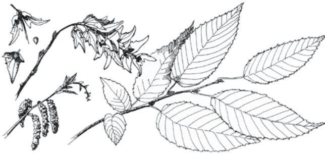
AMERICAN HORNBEAM Carpinus caroliniana

Haverford College Arboretum values the importance of its rich history, natural landscape, and the opportunities they present. Working with different communities, we serve to educate and preserve this ecologically diverse habitat and provide stewardship for our collections for generations to come.