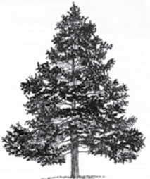
EASTERN RED CEDAR Juniperus virginiana