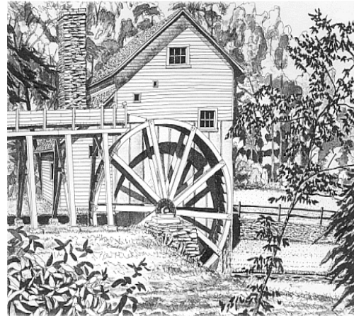
This sketch is an example of a mill located on a waterway showing the millwheel and race .

Volunteers are needed for the many activities carried on by the Society. Would you like to join the Kemper Girls? They proudly keep the Residence in museum quality condition and host the benefit teas. Docents are needed for special events, i.e., Taste of the Mountains Street Festival, visits from school children and visiting tourists. Rita Cunningham (948-6542) will be happy to talk to you regarding these opportunities.