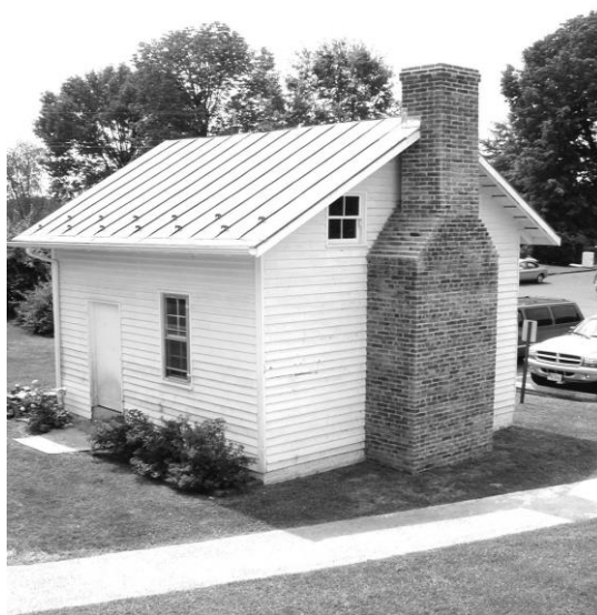
Law Office with new chimney