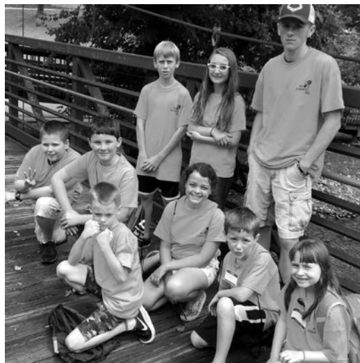
The Juniors out exploring Cherokee at the State Convention in 2016.

I encourage you all to bring your children or grandchildren to be a part of the NCRLCA family.