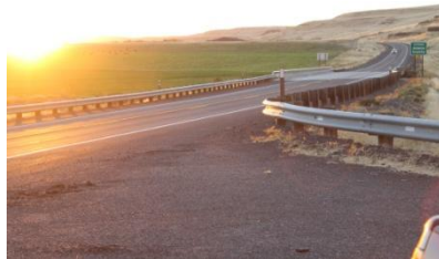
Setting sun on the Whitman/Adams County Line

The sun was near the horizon and everyone was on 40M. I had been on the road 12 hours by now and I still had to get all the way to Pend Oreille county north of Spokane.