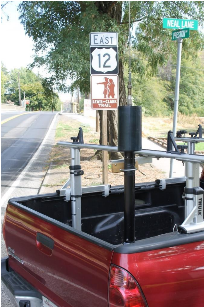
Lewis and Clark were the original Salmon Run Team

Each Salmon Run has been a unique experience. That's good, I wouldn't want to get in a rut. I have some ideas on how to improve performance which I hope to try out in the 7th District QSO Party in May.