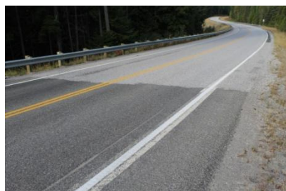
Can you guess where the Pend Oreille/Stevens county line is?

I woke up early to head for the Pend Oreille/Stevens county line. I arrived an hour early and just enjoyed the peace and quiet.