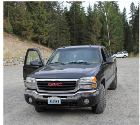
The K7TQ mobile