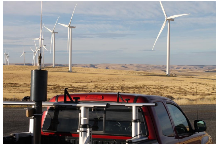
If I could just plug in