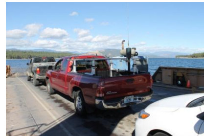
My favorite county line where I can't actually work anybody. Stevens/Ferry line in the middle of the Columbia river

I worked myself westward through Okanagon/Ferry, Douglas/Grant, and finally to Blewett Pass (Chelan/Kittitas) for the last half hour of the contest.