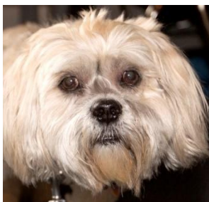
September Meeting Guest

See you at the upcoming October 17 General Membership Meeting!