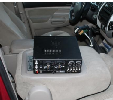
Testing locations... The big Rita board goes on the seat under the K3 and there's a whole bunch of other stuff as well

Many stops were on county lines but some counties just don't have a conveniently DRY border. At each stop, I had a windup kitchen timer I would set and when it rang, it was time to go. I think I hit each county within 5 minutes of the plan except for Franklin on the first day. I sorta forgot about the need to occasionally eat, drink, and get gas. Fortunately, I had put enough spare time in the schedule to make it up as the day went on.