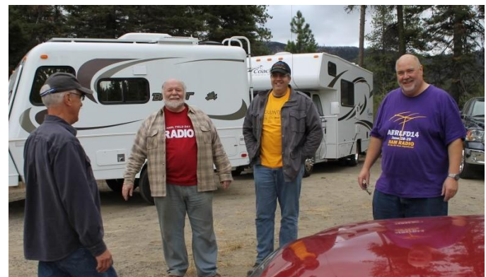
A fine K7ANE team with not one... but TWO RV's (someone needs to show these boys how to do CW)