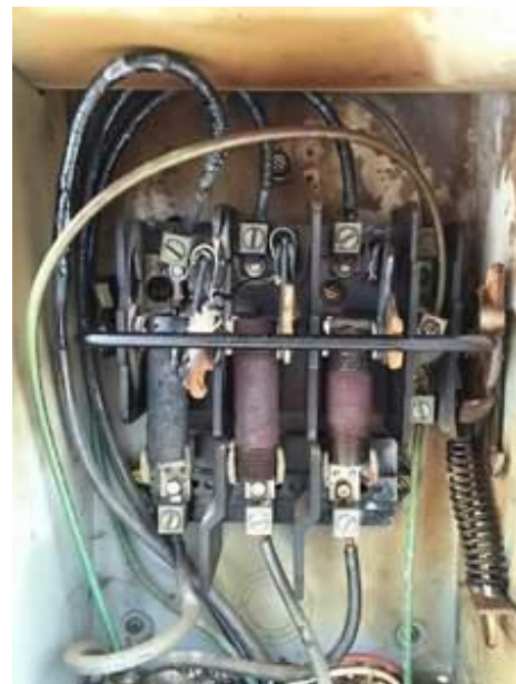
Using pipe nipples as fuses is NOT a good idea

The CHIP is an innovative open hardware project, with open source software. The board's spec is a 1GHz R8 ARM processor with 512MB of RAM, 4GB of NAND storage, and Wi-Fi and Bluetooth built-in. With these specs, its $9 price makes it one of the best computing platform deals we've ever seen.