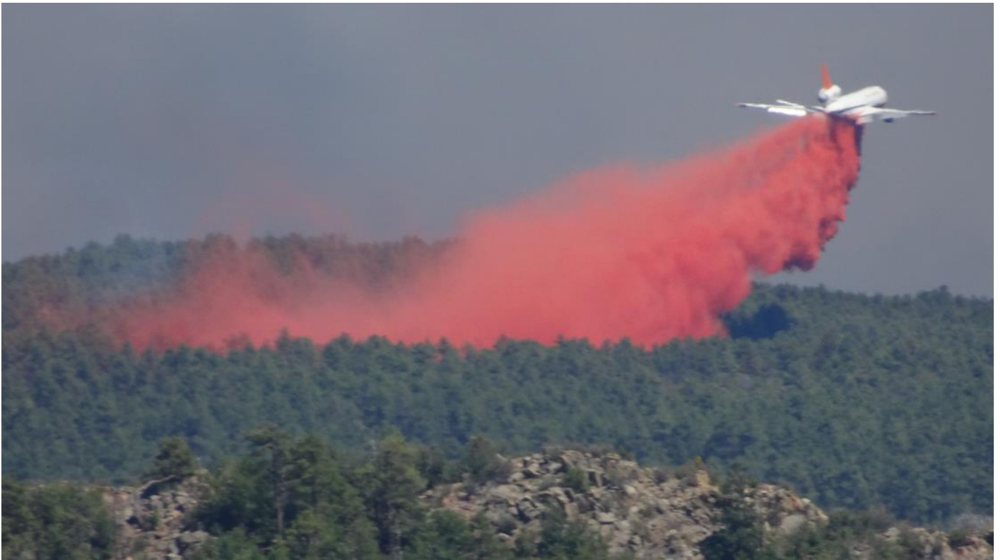
DC-10 Slurry Drop at the Goodwin Fire (Taken from the Spruce Mountain fire lookout tower)