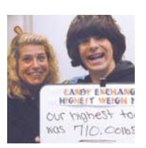
Top candy donor at Faber Orthodontics Candy Exchange donates more than 700 pounds of candy!

One phone call to Dolphin Imaging transformed the operation of our program last spring. The wonderful folks at Dolphin donated their software and helped our staff repurpose their orthodontic practice management software to meet the needs of our national nonprofit program. With Dolphin management in place, applicant and provider communication, participant case management and alumni relations are more streamlined and efficient. The rapid expansion of our program would not have been possible without this tremendous boost to our productivity. Thank you Dolphin!