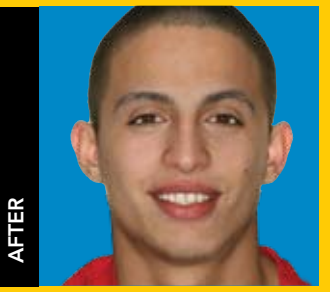
A recent SCL alumnus