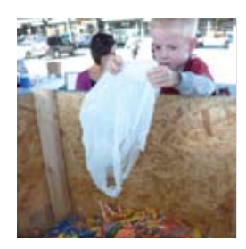
Kids happily share their candy at the City Market in Kansas City knowing their sweets will be donated to troops overseas.