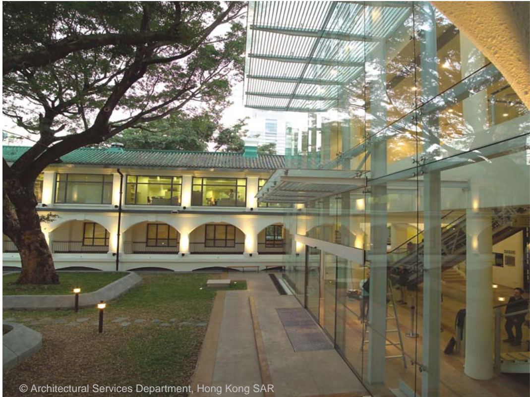
Whitfield Barracks (Hong Kong SAR, China) wins the Jury Commendation for Innovation Award of Excellence in the 2007 UNESCO Asia-Pacific Heritage Awards for Culture Heritage Conservation

The 2007 Heritage Awards Jury Commendation for Innovation was awarded to Whitfield Barracks (Hong Kong SAR, China) . The Jury Commendation recognizes newly-built structures which demonstrate outstanding standards for contemporary architectural design which are well integrated into historic contexts. The 2007 Jury Commendation submissions include five projects (hotels, religious site and a public institution) from three countries in the region.