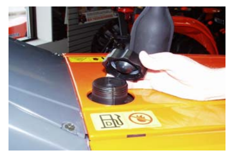
Fig. 4.6.1.b. Check the fuel level.