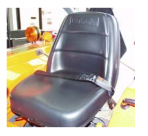
Figure 4.6.6.c. Tractors with ROPS come equipped with seat belts. Use them.