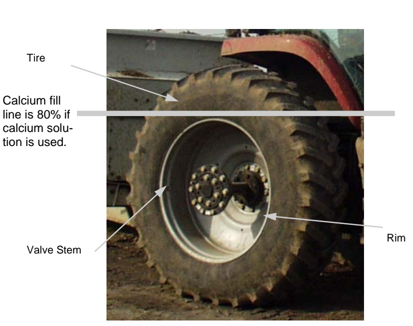
Figure 4.6.5.a. Tractor tire components include the tire, the rim or wheel, an inner tube with valve, and, many times, a calcium solution filling about 80% of the inner tube.

Tractors are not built for high speed. High speeds on paved roads reduce tire life. Unpaved roads can do the same and also increase the chance for large stones to damage the tire as well.