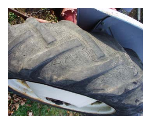
Fig. 4.6.5.b. Worn treads and dry rot make for poor traction and risk for downtime due to a blowout.