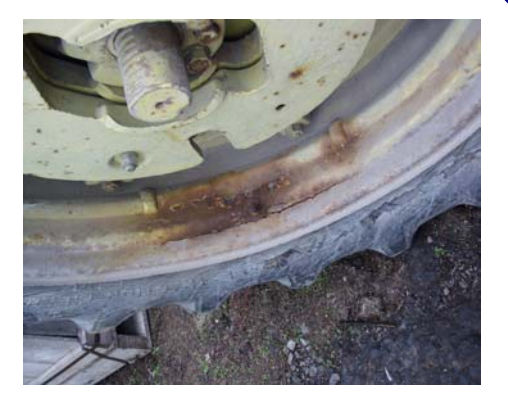
Fig. 4.6.5.d. A leaking valve stem released calcium solution which rusted the rim. A major expense will be incurred, as well as a severe safety hazard in using this tractor.