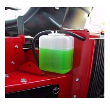
Fig. 4.6.1.d. Check the coolant level with the engine cold.

Save an engine from costly repairs; check the fuel, coolant, and oil levels before starting the engine.