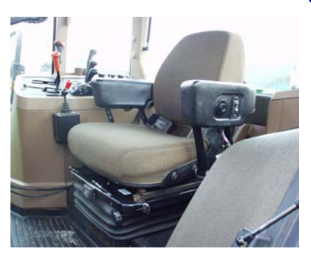
Figure 4.6.6.e. Locate seat adjustments and know how they work. You may need the Operator's Manual.

Seat belts keep tractor drivers from being thrown out of the cab or off the seat during roll-overs. Wear your seat belt!