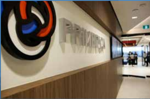
Primerica Canada's headquarters in Mississauga, ON, services more than 12,000 Canadian representatives who help thousands of families throughout Canada.

Founded in 1977, Primerica is focused on the middle-income market. Primerica teaches people important financial concepts including how to become debt free, properly protected, and financially independent. Our home offices in Duluth, GA, and Mississauga, ON, support thousands of independent contractor representatives serving families across North America.