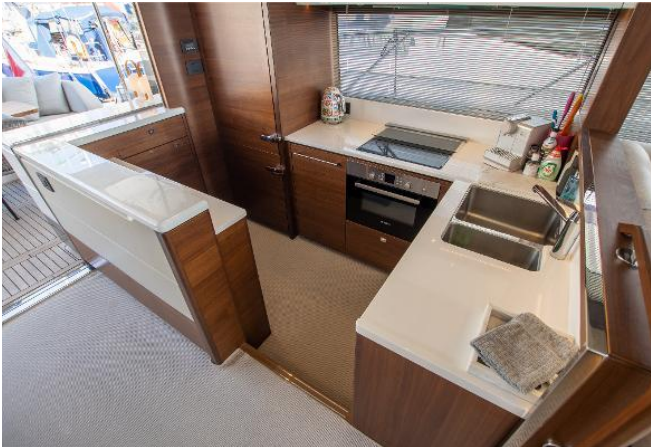
Princess F70 For Sale