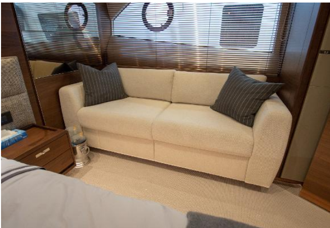
Princess F70 For Sale