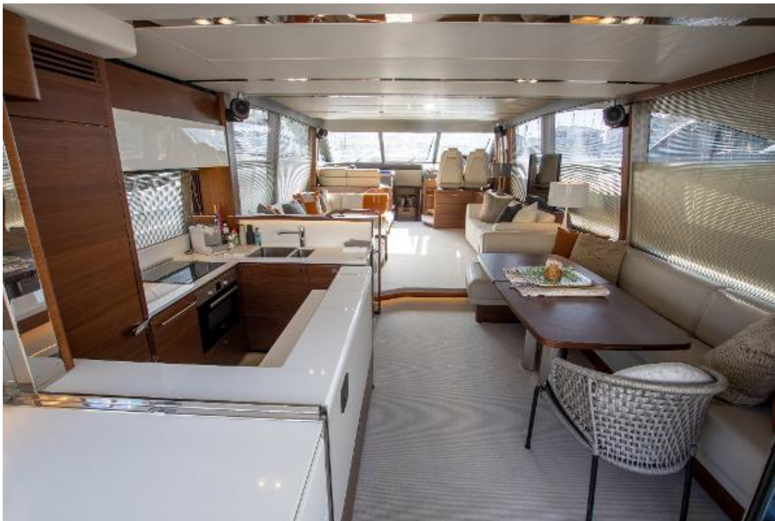
Princess F70 For Sale