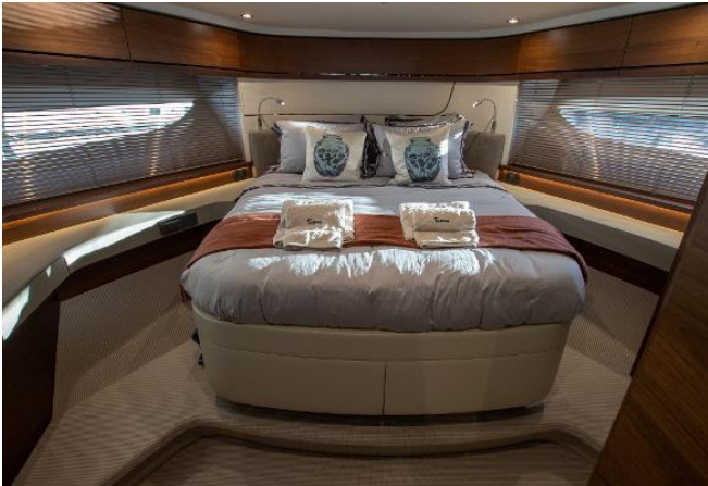
Princess F70 For Sale