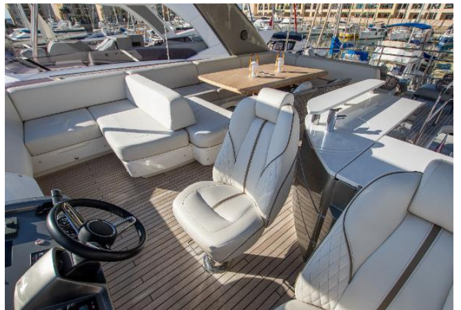
Princess F70 For Sale