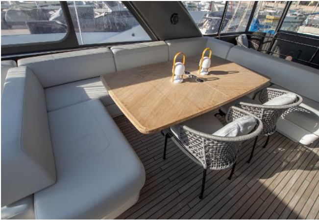
Princess F70 For Sale