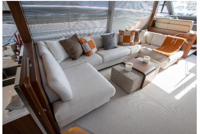
Princess F70 For Sale