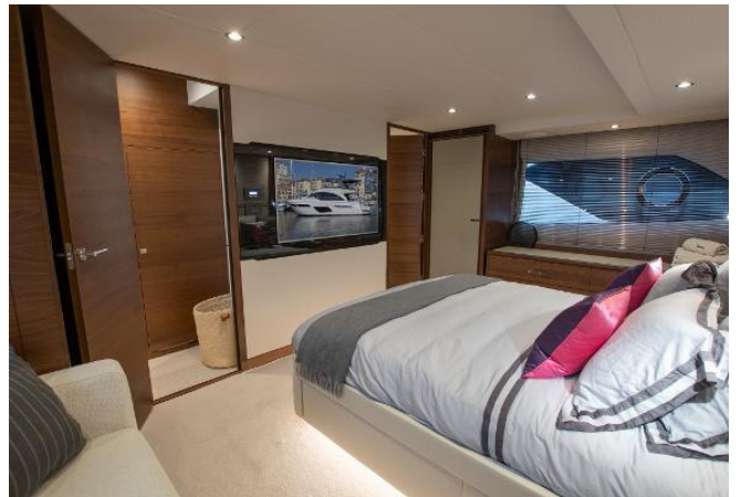
Princess F70 For Sale