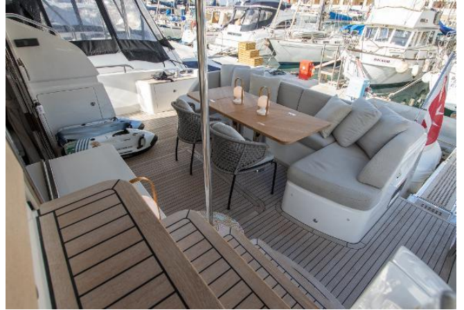
Princess F70 For Sale