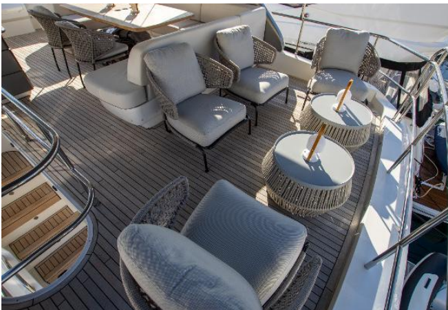
Princess F70 For Sale