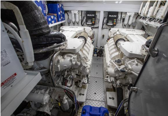
Princess F70 For Sale