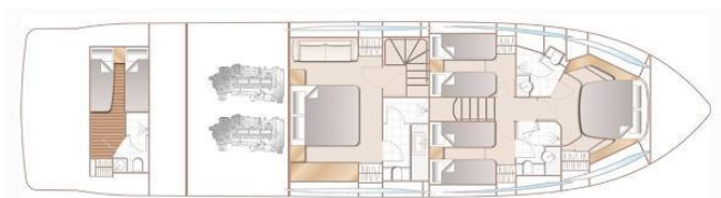
Princess F70 Lower Deck Layout Plan