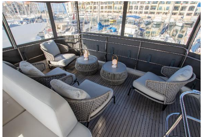
Princess F70 For Sale