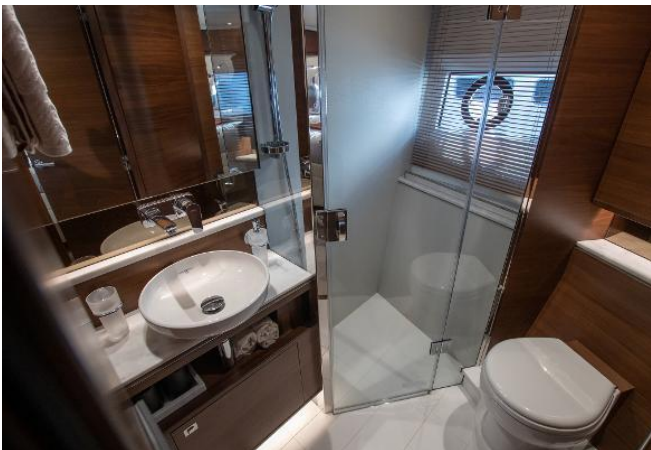
Princess F70 For Sale