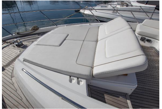
Princess F70 For Sale