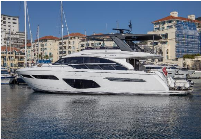
Princess F70 For Sale