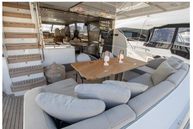
Princess F70 For Sale