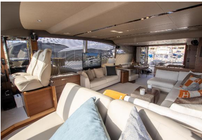
Princess F70 For Sale