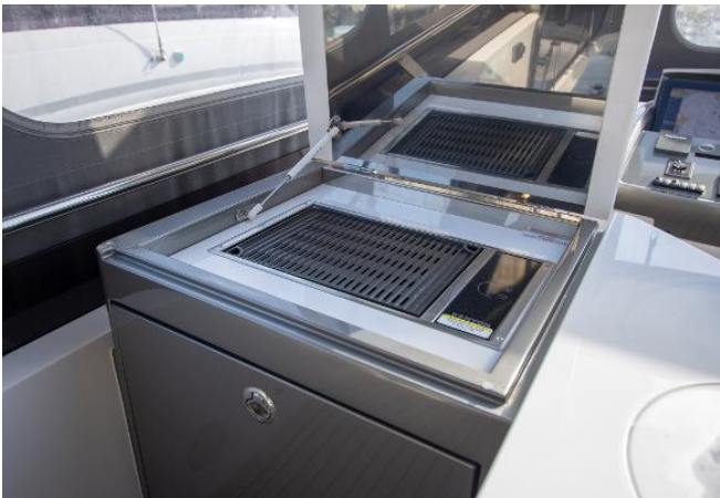
Princess F70 For Sale