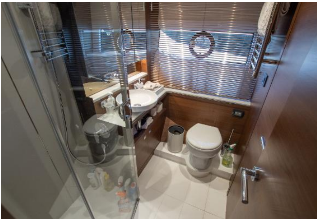
Princess F70 For Sale