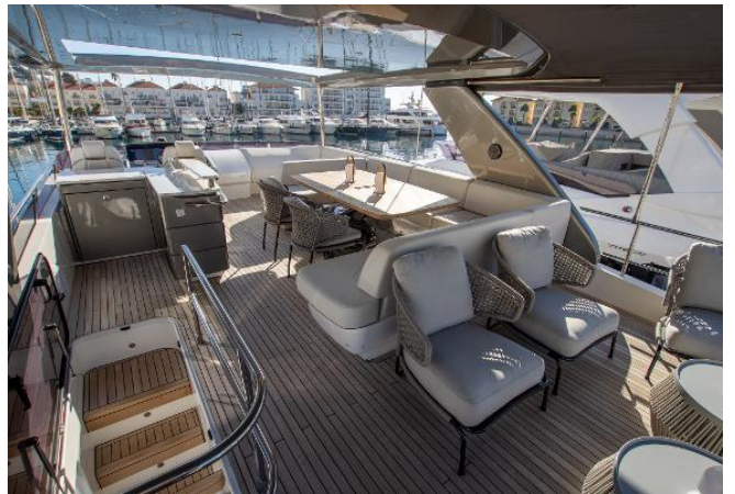
Princess F70 For Sale