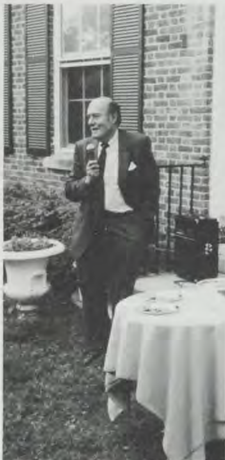
Nicholas Katzenbach '36 accepting the 1988 Alumni Award.