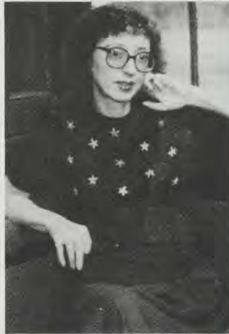
Author Joyce Carol Oates