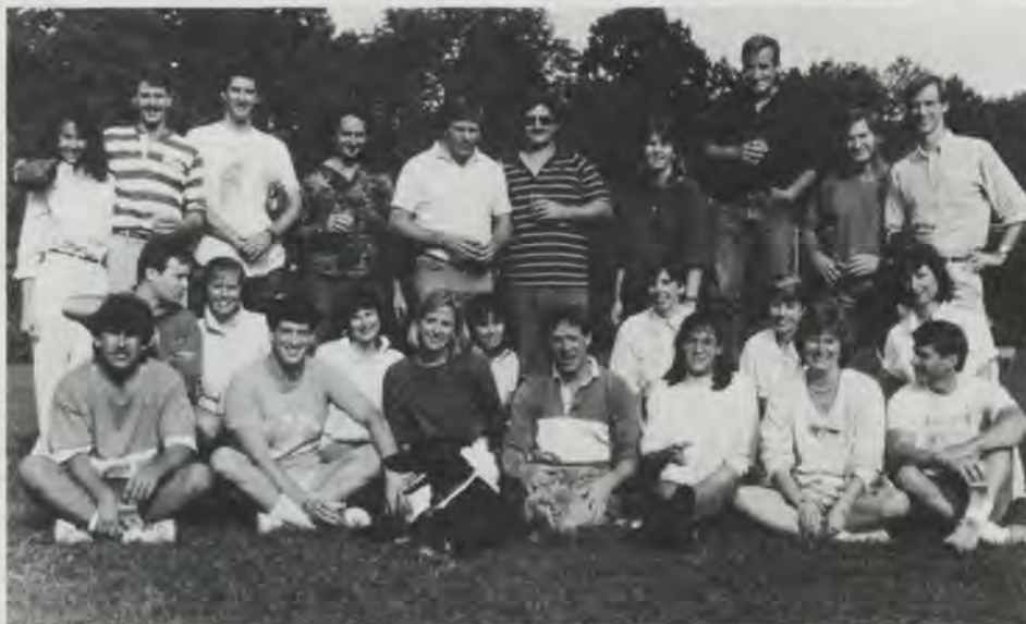
1978's more athletic members pose before their marathon softball game at PDS in September.

The importance of this approach to teaching history was reinforced for me when I read about the report of the National Endowment for the Humanities on the state of the humanities in colleges and universities in the Chronicle of Higher Education and the winning essay in the History Book Club's