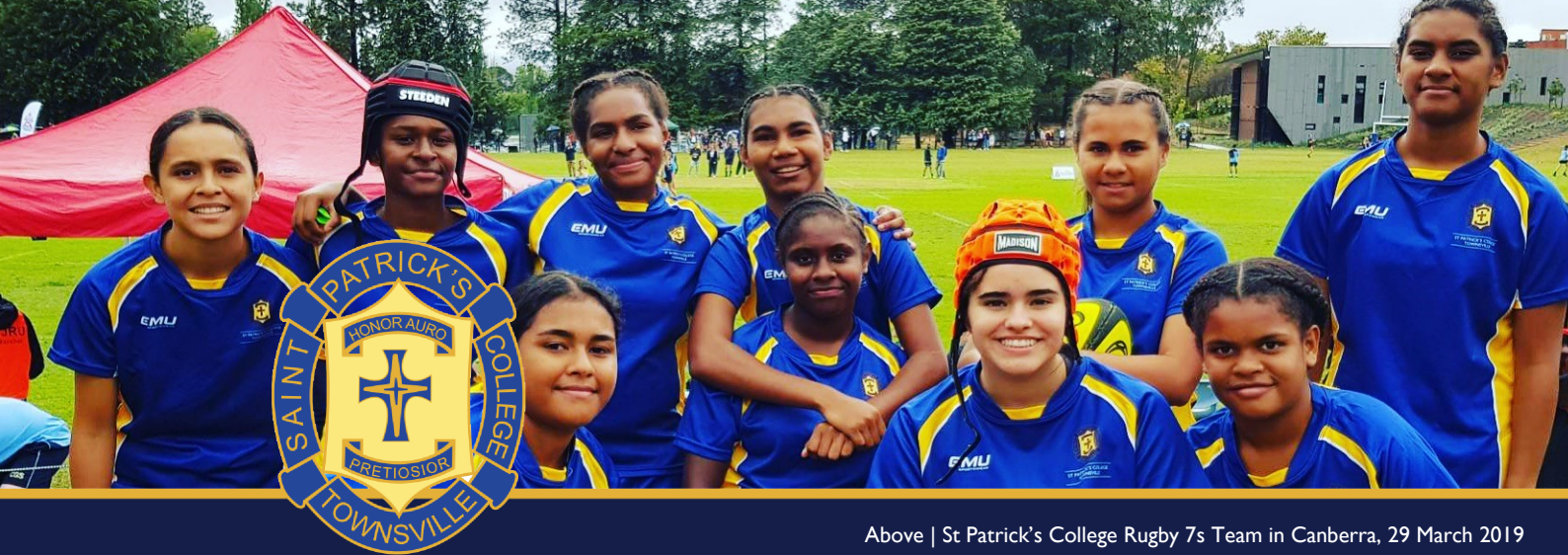
Above | St Patrick's College Rugby 7s Team in Canberra, 29 March 2019