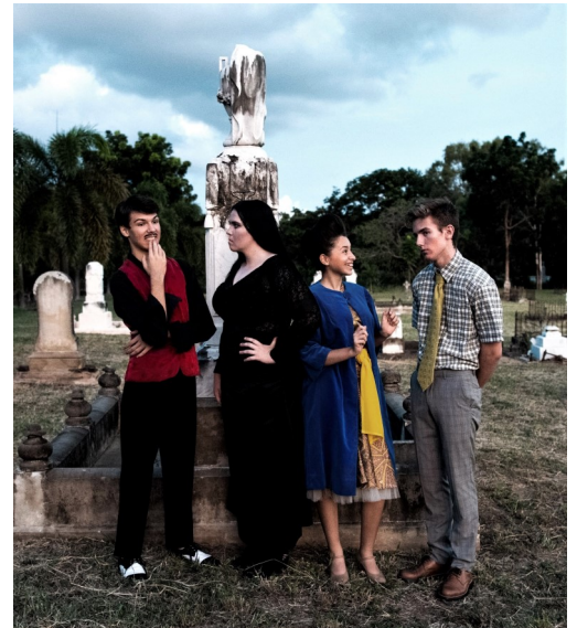
Above | Will Wednesday and Lucas be able to overcome the differences between their families?

Planning is also underway for a matinee performance on the morning of 6 June to be open to Yr 7 students at participating schools and a select group of Yr 6 students from local primary schools. Please "Like" and monitor the College's Facebook account for updates.