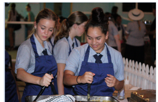
Above | Yr 12 students served up a feast at the 2019 Open Night.

The Yr 11 students offered a range of hot beverages at their coffee cart and proved themselves to be skilled baristas serving up cappuccinos and the like. Their assortments of baked goodies included rocky road, classic fudge brownies, chocolate chip cookies, as well as gluten-free chocolate fudge muffins and salted peanut butter cookies. Yum!