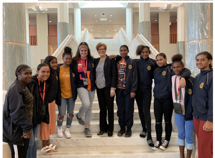
Above | The St Patrick's College Rugby 7s Team enjoyed some sightseeing during their Tournament weekend and were excited to meet MP Cathy O'Toole at Parliament House.