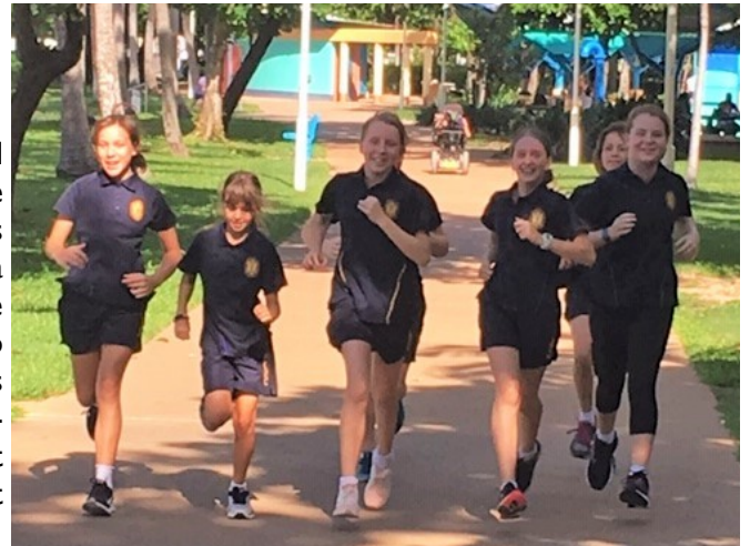
Above | Strand Running Club members completing a lap of The Strand.

Nearly 90 students signed up for St Patrick's College 'Strand Running Club' earlier this term and have now been running The Strand for the past four weeks. This Club has a number of goals focussed around improving health and mind, and provides a great opportunity at the same time to socialise and take in the wonderful views. This is a great chance for students to help prepare for the upcoming Interhouse and Interschool cross country and they will get the chance to learn about the importance of stretching, strategizing and motivation. Throughout the year, the Running Club will also provide information about upcoming fitness events around town such as Townsville's Running Festival, Trail runs and charity runs.