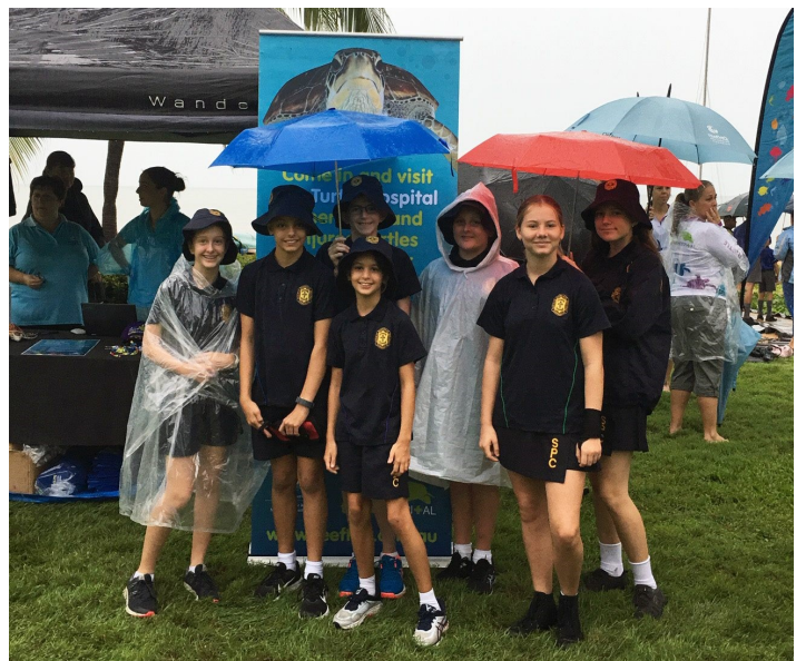
Above | Members of St Patrick's College Reef Guardian Club attending the Reef HQ Turtle Release on the Strand on Friday 29 March

Students at St Patrick's College are actively encouraged to engage in STEM subjects and the College has a number of innovative extracurricular programs available to promote this field of study, including Marine Science, on offer for our year 11 & 12 girls. To learn more, please see: https://www.stpatscollege.qld.edu.au/curriculum-79u2k7/academic/stem-yc7p5s/