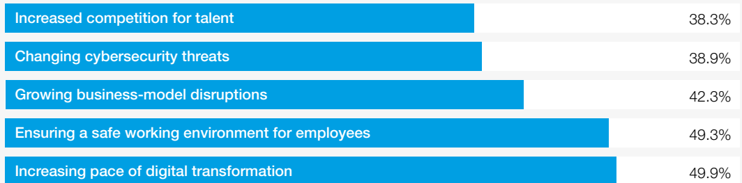
FIGURE 2 What five trends do you foresee having the greatest effect on your company over the next 12 months?