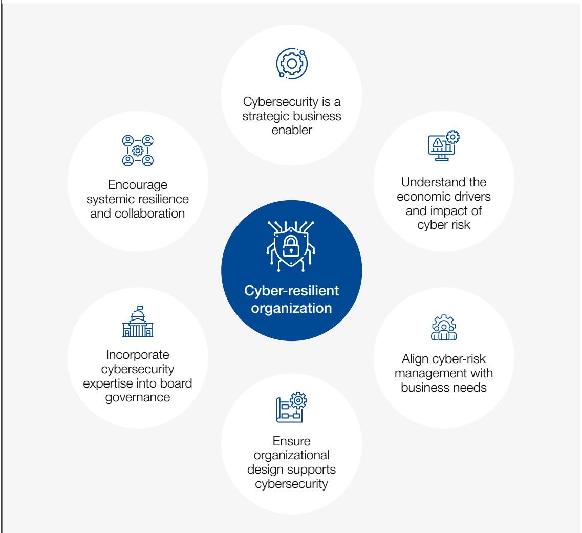
FIGURE 3 Consensus principles visualized

Next, this report expands on these principles, with additional context to facilitate adoption and understanding. Additionally, included under each