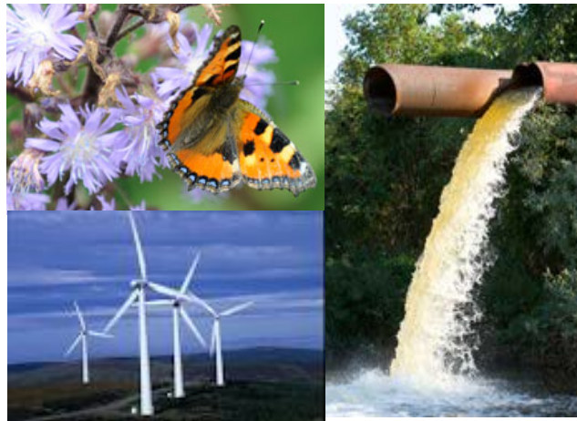
© European Commission, European Environment Agency