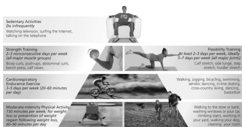
FIGURE 2.3 Physical activity pyramid.

© 2011 McGraw-Hill Higher Education. All rights reserved.