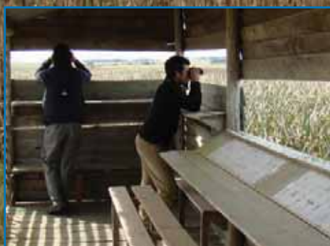
Aves Uruguay, in conjunction with the Ministry of Tourism, designed and constructed birdwatching hides throughout the country. This activity has had an important impact on society, highlighting a previously unknown activity in Uruguay, namely, birding.