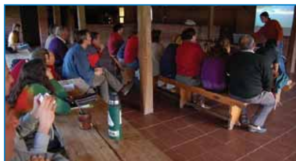
Workshop at Laguna de Rocha (UY019) promoting natural grassland conservation with local farmers as part of the Grasslands Initiative ( www.pastizalesdelconosur.org ).

The IBA network in Uruguay is of great importance to migratory species. Sites in the southeast and northeast of the country act as overwintering sites for shorebirds (both Neartic and Neotropical migrants), as well as for migratory Passeriformes. Sites identified on the shores of the River Uruguay have a strong component of migratory species, especially Passeriformes of the genus Sporophila (Rocha & Claramunt 2003).