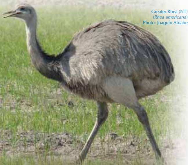
Greater Rhea (NT) ( Rhea americana )

“Bird species of conservation priority are currently being selected, with a view to identifying and creating new protected areas.”