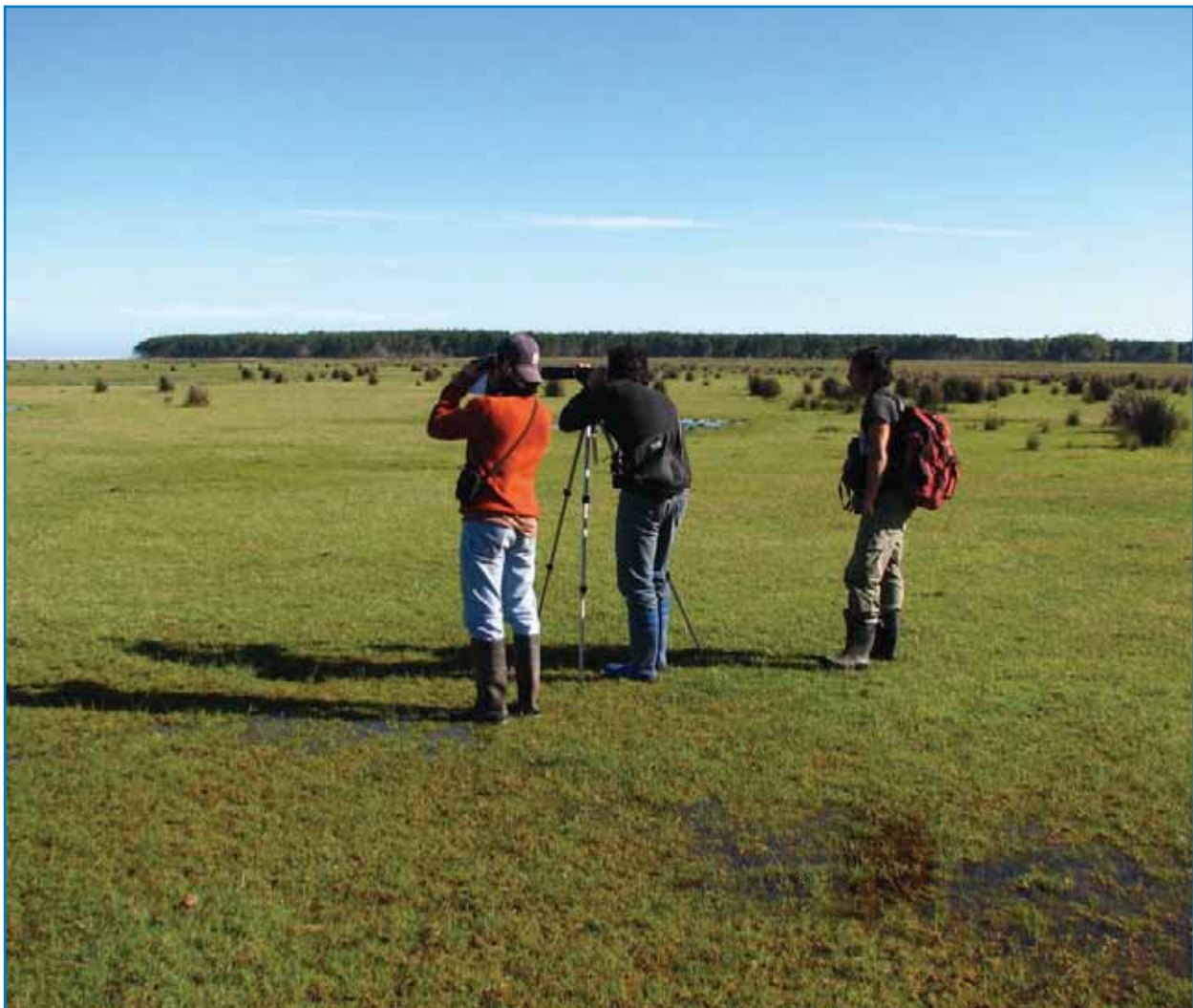
Bird monitoring is one of the objectives of the next stages of the IBA program in Uruguay.