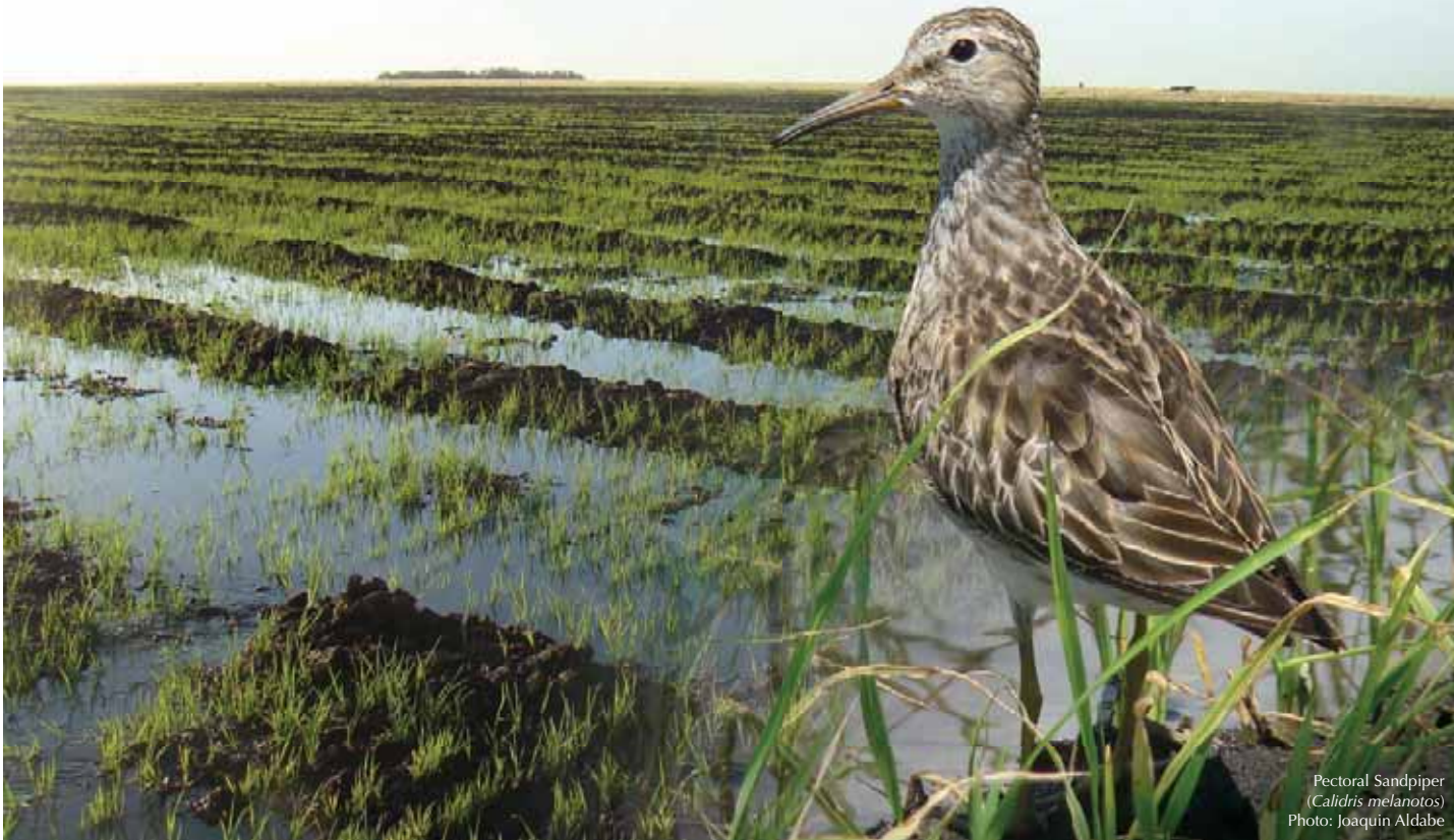
Pectoral Sandpiper ( Calidris melanotos )

birds in rice paddies have already been carried out in the east, therefore Aves Uruguay is implementing a research and conservation project on Nearctic migratory shorebirds in the north of the country. The objective of this study is to determine how these birds use rice fields as well as creating awareness among the rice industry on the importance of these birds. Aves Uruguay has strategic alliances with several institutions, such as Grupo para la Protección Ambiental Activa de Bella Unión, Wetlands International, Asociación de Cultivadores de Arroz, Museo Nacional de Historia Natural y Antropología, Vida Silvestre Uruguay, PROBIDES and Ministry's Responsible Production project.