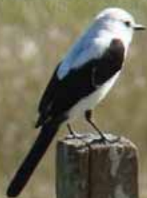
Black-and-white Monjita (VU) ( Xolmis dominicanus )