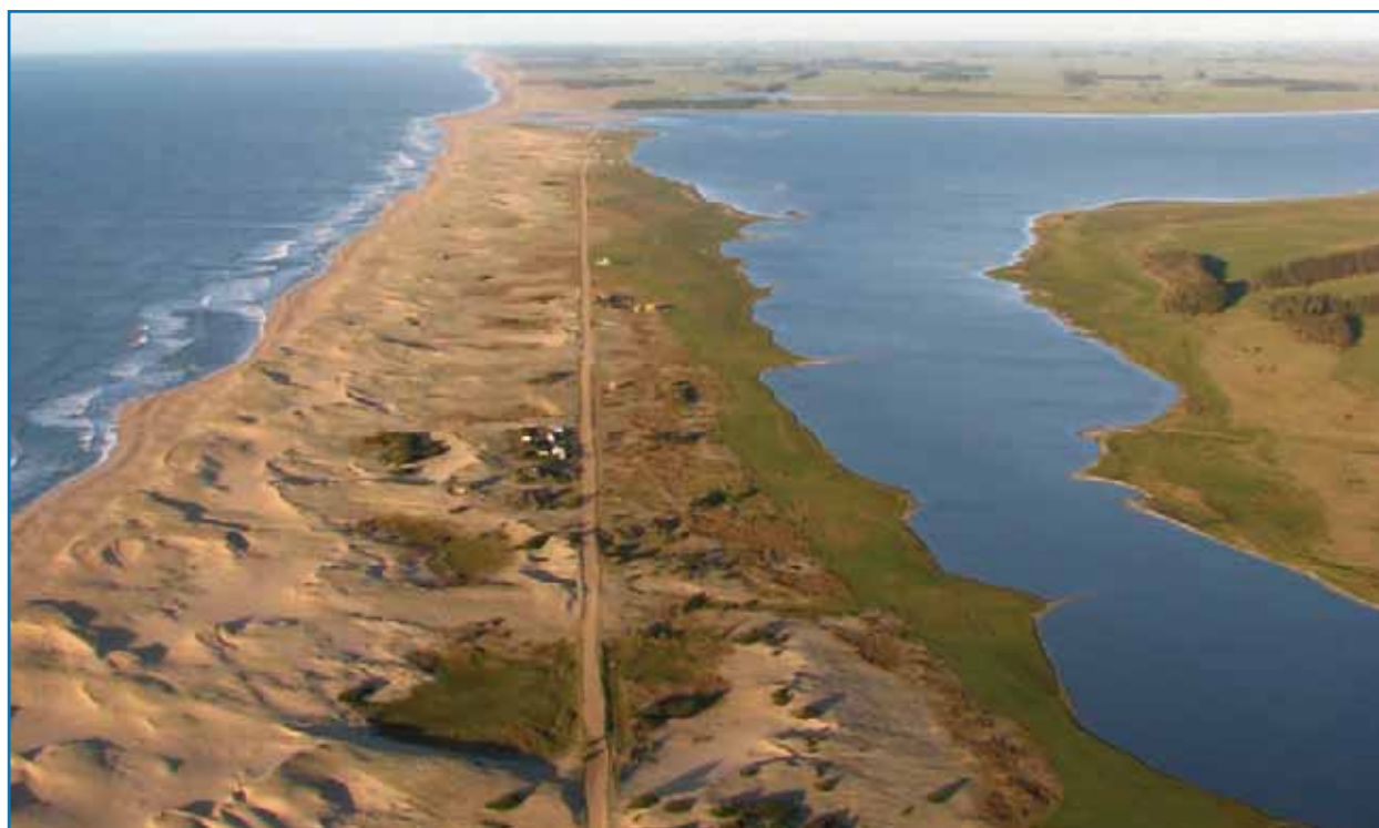
Laguna de Rocha (UY019) has the highest known population of wintering Buff-breasted Sandpipers ( Tryngites subruficollis ) in any IBA in the Americas.

Despite there being a relatively complete legal framework covering environmental and conservation issues in Uruguay, the country is passing through a difficult moment in terms of biodiversity conservation. This is mainly due to the aforementioned intensification of land use, particularly in terms of Pinus and Eucalyptus plantations and cattle ranching. However, the new protected area system and programs such as "Responsible Production" could lead to more favorable circumstances (see Opportunities below).