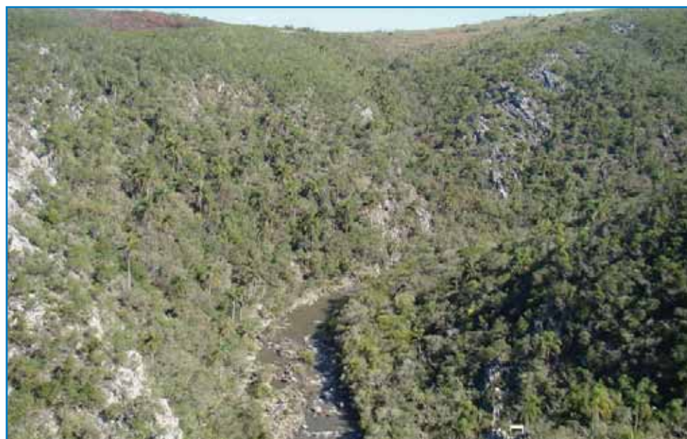
The IBA Quebradas de Treinta y Tres (UY014) was the first protected area to be included in the new system of protected areas. A management plan is currently in preparation.

Uruguay has 3,241,003 inhabitants, of which 92% live in urban areas, and 41% live in the capital, Montevideo (Instituto Nacional de Estadística 2004). This implies a very low population density, clearly reflected in important areas of natural landscapes (i.e. not urbanized). No indigenous groups have survived in Uruguay although the country's original inhabitants played an important role in achieving independence in 1825, alongside other minority ethnic groups such as African slaves. The subsequent blend between this group and European immigrants, mainly Italians and Spanish, created a unique culture, most visible in the figure of the Gaucho, or Pampas cowboy, in the River Plate area. Literacy rates in Uruguay are of the order of 99%, one of the highest in the Americas.