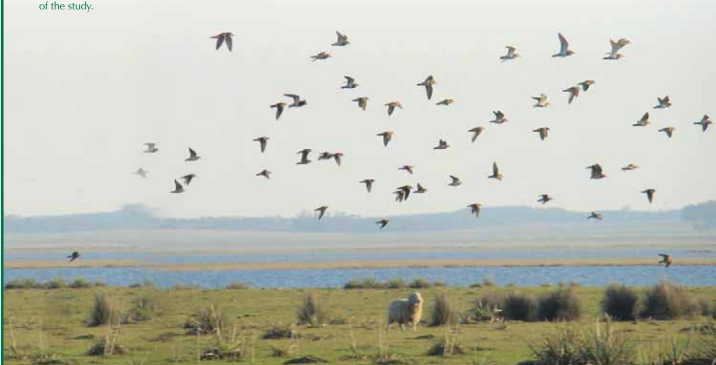
Laguna de Rocha (UY019).

Subsequently, Aves Uruguay (within BirdLife's wider Grasslands Alliance) and Wetlands International encouraged the participation of two rural farmers in government sponsored conservation projects, as part of the Responsible Production program. These projects aim to conserve the above shorebirds' habitat, at the same time as meeting the production needs of landowners