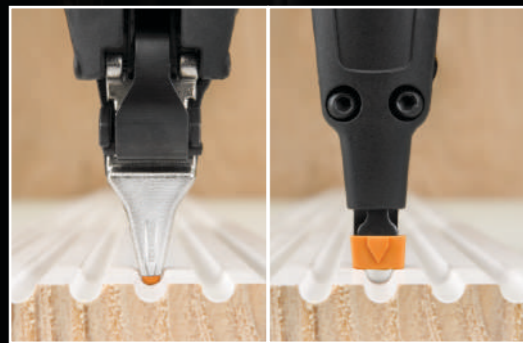
80% SMALLER NOSE THAN CURRENT BOSTITCH NAILERS