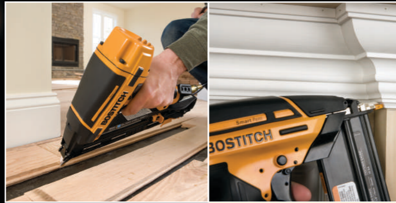
EASY TO SEE WHERE NAIL IS DRIVEN