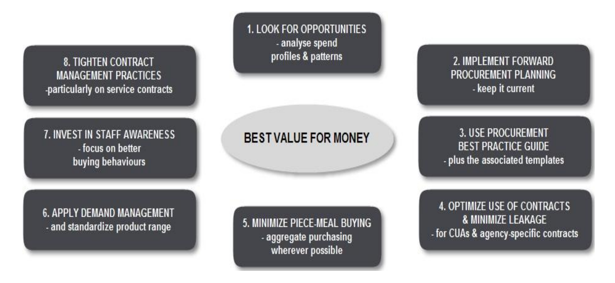
Figure 2: Smarter buying principles

68. With substantial financial resources at stake, procurement activities pose significant financial, reputational and operational risks for the organizations. The fragmented approach inevitably leads to a waste of resources and lost opportunities in achieving best value for money. It is therefore important that the organizations adopt a consolidated analytical approach to carry out procurements effectively. Smarter Buying Principles<sup>16</sup> (figure 2) can provide a good framework for the analysis and design of procurement strategies: