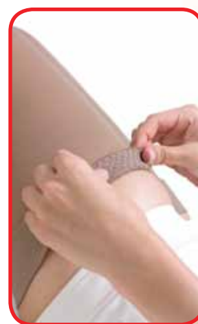
Silicone Topband Which Prevents Stocking from Slipping