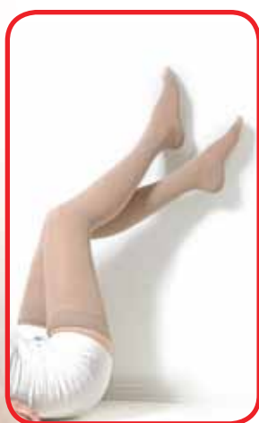
Thigh Length Medical Compression Stocking with Closed Toe