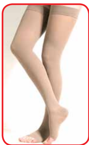
Thigh Length Medical Compression Stocking with Open Toe