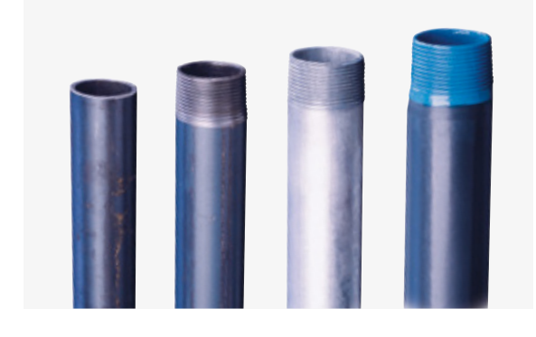
ABB works hard to provide standards-compliant PVC-coated conduit. It is this dedication to superior quality that makes Ocal "better by design."