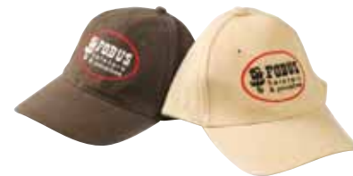
Fobus Ball Caps